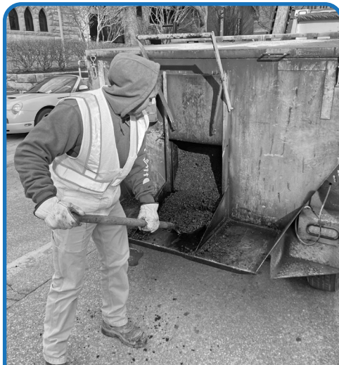
Hot asphalt on the go: A mobile unit ensures immediate access to material for pothole repairs.

Potholes are a perennial problem, often forming when water infiltrates cracks in the road, where it freezes and expands. This process weakens the pavement, leaving behind widespread hazards and deteriorating the surrounding pavement.