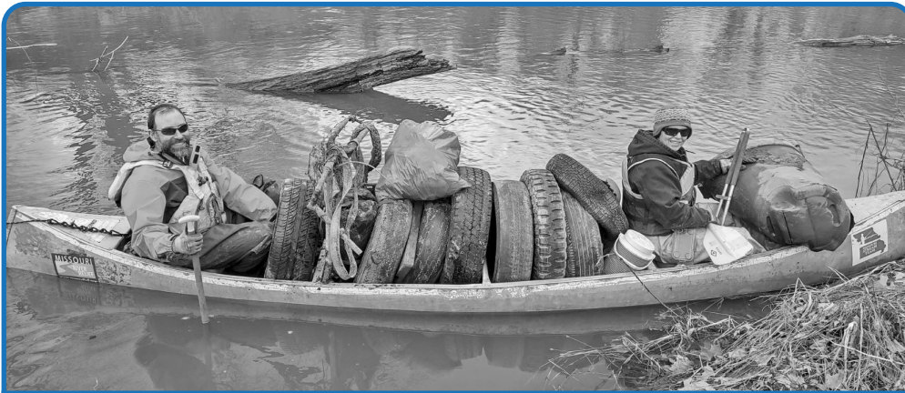
Members of The Gamers Stream team on an in water cleanup of the Hinkson Creek. This skilled volunteer team does in-boat, high water, cleanups of the Hinkson twice a year.

Cleanup Columbia, our annual city-wide litter pick up event, is happening now! Individuals, families, businesses, and groups of all sizes and types are welcome to join the fun to see what surprises they encounter while volunteering!