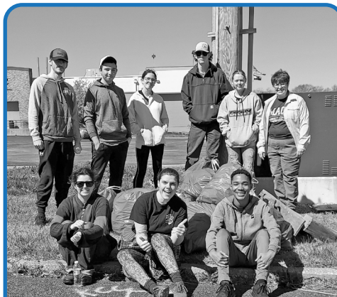
Students from Moberly Area Community College participate in Cleanup Columbia each April, picking up litter near their location in the Parkade Center.

Register online at CoMo.gov/volunteer . For more information, contact us at Volunteer@CoMo.gov or 573.874.7499.