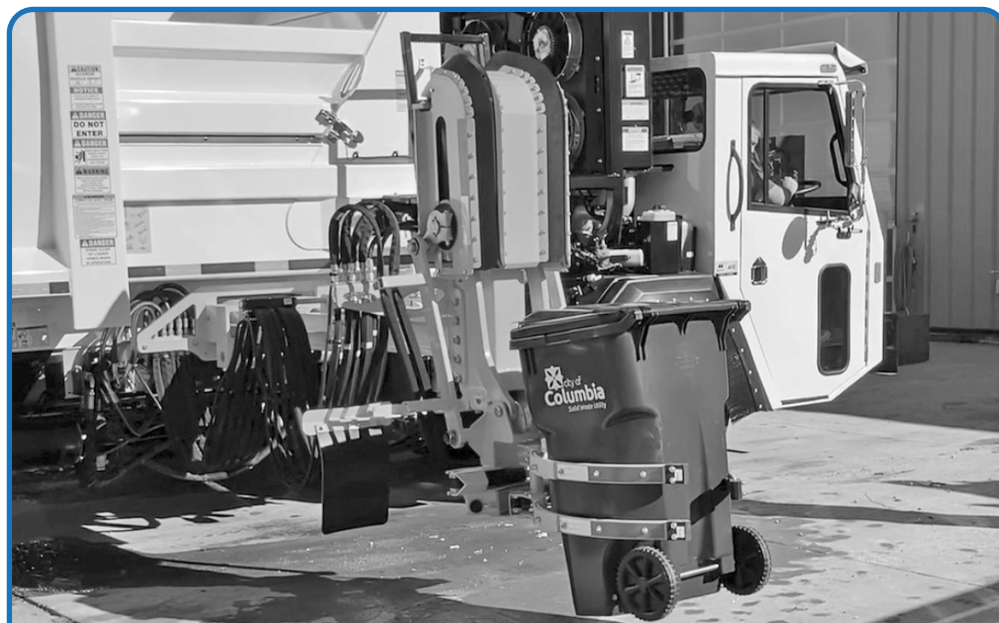
The Solid Waste Utility received its first side-loader truck for automated residential collection Nov. 15. Solid Waste will have a fleet of nine full-size trucks and two smaller trucks on their daily routes.

Customers may request to exchange their refuse cart one time at no charge within the first 120 days of initially receiving the cart. The customer can either call the Contact Center at 573.874.CITY (2489) or email Waste-Mgmt@CoMo.gov to request a different size of roll cart.