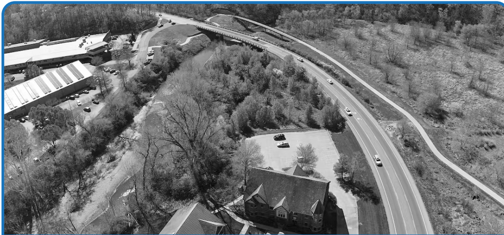
An aerial view of Forum Boulevard and the bridge over Hinkson Creek. According to the results of the traffic study, the road would benefit greatly from an expansion to four lanes.

On Nov. 30, City residents were invited to attend a meeting to discuss the future of Forum Boulevard between Chapel Hill Road and Woodrail Avenue. A traffic study had surveyed the area and determined that due to the growing number of vehicles, Forum Boulevard would benefit from an expansion to four lanes and multiple intersection improvements. Additional sidewalk and bike lane enhancements would also be included as part of the project, as would stormwater improvements and replacing or widening the bridge.