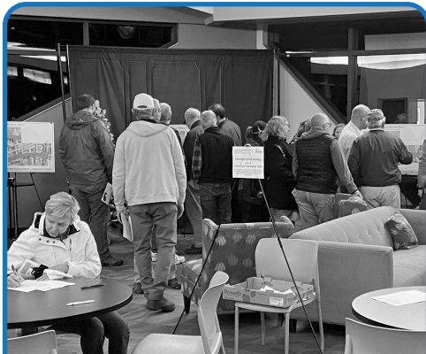
At interested parties meetings, residents are able to review plans, speak with staff and leave comments, either on paper or through BeHeard.CoMo.gov .

These open house gatherings mark the early stages of roadway design projects, where community voices take center stage. While reviewing the concept plans, resident comments, left either on paper or on the project's BeHeardCoMo page, help to shape the designs.