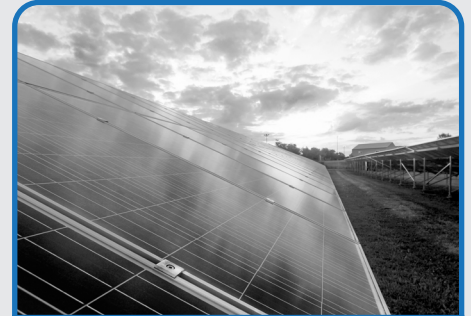
The Community Solar program offers Water & Light electric customers access to renewable energy through a subscription program.

City of Columbia Water & Light knows that there are many residents who want access to solar energy but have mitigating factors that prevent them from making the investment.