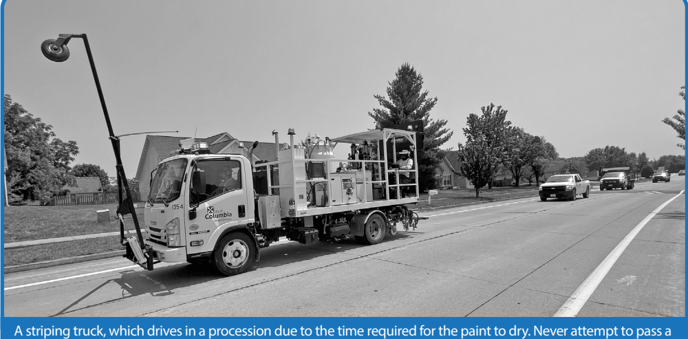
A striping truck, which drives in a procession due to the time required for the paint to dry. Never attempt to pass a line of striping trucks-instead, use the next intersection to find an alternate route.

The City of Columbia Public Works department is dedicated to ensuring well-maintained roads for everyone's benefit. We have recently been able to update some of our equipment to provide better, more visible stripes. Public Works staff would like to take this opportunity to request your help in making our street striping operations a success and continue to improve the visibility of markings for our roads.