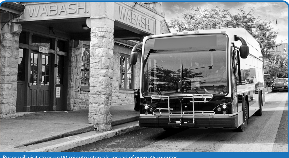
Buses will visit stops on 90-minute intervals, insead of every 45 minutes.

Starting Tuesday, Aug. 1, Go COMO's six fixed bus routes will be combined into three, ensuring that we can continue to meet the needs of our valued riders. Under route combining, just like the Saturday service that riders are already accustomed to, the blue route will merge with the gold route, the black route with the orange route, and the green route with the red route.