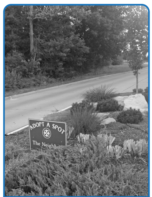
Richard and Colleen Olesen started caring for this median in Barnwood Drive in 2019 to help improve the entrance to their neighborhood from I-70 Drive NW. Thank you, volunteer adopters!

Columbia has more than 100 Adopt-A-Spot Beautification areas through the City maintained by volunteers. This is one of the most challenging volunteer assignments, due to the size, location and hard work required to maintain landscaping. Volunteers also find it tremendously rewarding because the results of the work is highly visible; their beds are enjoyed by hundreds of residents and visitors each day.