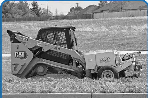
Workers with DJM Ecological Services operate a skid steer with a no-till drill seeder front attachment at one of Columbia's roadside pollinator sites.

The City works with DJM Ecological Services of Missouri to promote the growth of native pollinators, fight invasive plants and meet the goals of the City's Climate Action and Adaptation Plan. This is part of ongoing efforts to increase populations of pollinating insects by encouraging the growth of plants native to our region and decreasing overall maintenance costs.