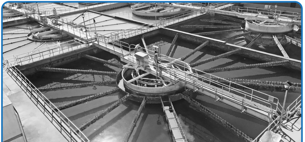
This report is intended to provide you with important information about your drinking water and the efforts made to provide safe drinking water.

Water & Light monitors and evaluates the quality of the water multiple times a day throughout the treatment process. The Utility tests samples from more than 40 locations — including from the groundwater wells, during the treatment process and throughout the distribution system.