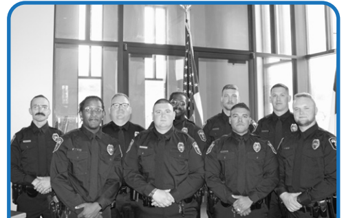
Columbia Police Department's fall 2022 graduating class following their graduation from the Law Enforcement Training Institute.

To graduate, firefighters completed more than 720 hours of basic fire academy training and advanced application skills training over the course of 18 weeks. Their training began April 18 and covered topics including fire dynamics, building construction, fighting fundamentals, hazardous materials response, technical rescue and extrication, CPR and AED certification, and more.