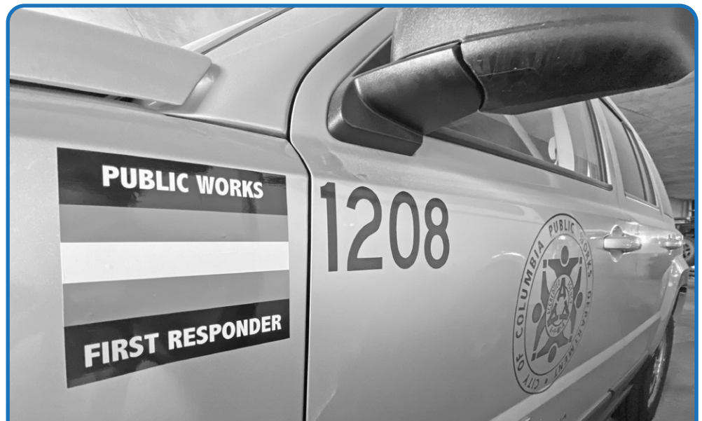
The orange, black and white Public Works First Responder symbol identifies certain personnel in their federally mandated role as first responders.

The City of Columbia Public Works department is committed to working with local, state and national agencies to help protect our community.