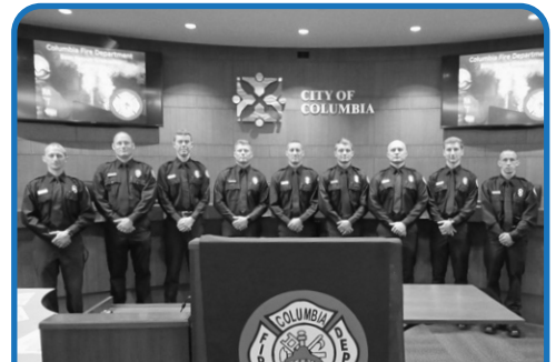
Columbia Fire Department Training Academy's graduating class for fall 2022 has now started the department's field training program.