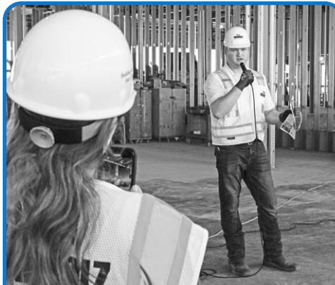
Developers from Nabholz Construction led guided tours of the new terminal.