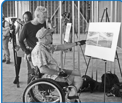
The new terminal at COU is on schedule to open in 2022.

Columbia residents saw firsthand the progress that has been made on the new terminal at the Columbia Regional Airport (COU), Tuesday, April 12.