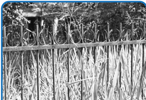
Overgrown yards are not only an eyesore but a community safety issue. Tall grass and weeds also harbor rodents and other vermin that are unsafe and unpleasant in residential communities.

To report a vegetation violation, call 573.874.CITY or report via the City's website at CoMo.gov .