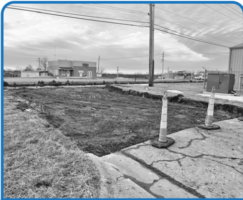
Wabash Drive Extension is expected to be complete by late spring or early summer.

Wabash Drive, a small and little-known road branching off from Vandiver Drive, could soon help to significantly improve nearby traffic conditions.