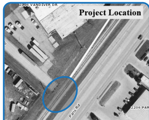
Wabash Drive Extension will relieve traffic congestion caused by highly traveled nearby roads.

Due to supply chain delays in obtaining materials, the project will be performed in two phases, with a pause in between phases to allow for delivery.