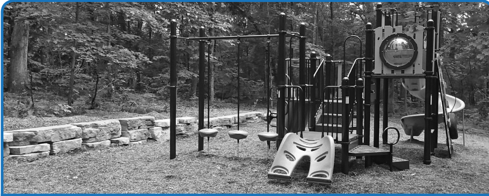
Renovations were recently completed at Oakwood Hills Park, which included replacing playground equipment

Columbia Parks and Recreation is completing a list of park projects promised to voters as part of the 2015 Park Sales Tax ballot issue. One of those projects funded by the Park Sales Tax is Oakwood Hills Park, 2421 Lynnwood Dr.