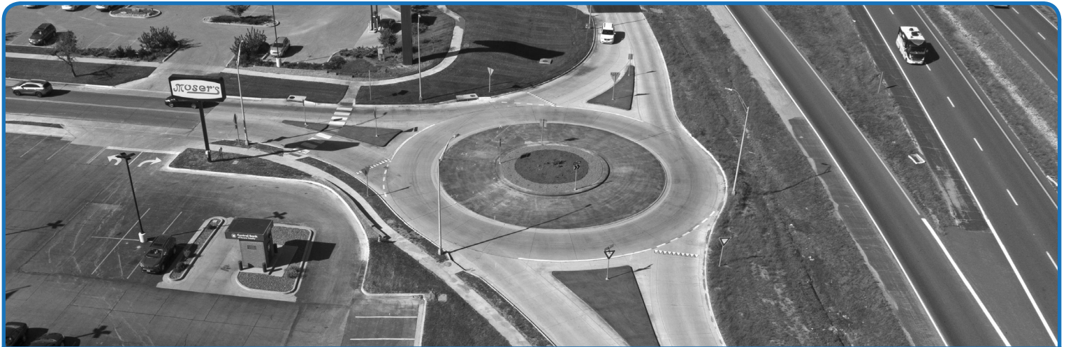
The new roundabout at the intersection of Keene Street and I-70 Drive Southeast was completed and opened to traffic in August.

A new roundabout was constructed this summer at Keene Street and I-70 Drive Southeast. This intersection enhancement was funded with the quarter-cent Capital Improvement Sales Tax and a cost share with MoDOT. The new roundabout project had an investment of $832,000.