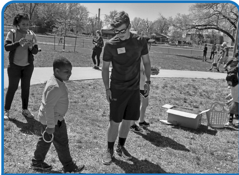
Volunteers host games and activities for kids at the Egg Hunt Eggstravaganza held at Douglass Park. (photo from spring 2019)