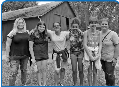
The Smithton Middle School Builders Club pose after helping with children's activities at the Heritage Festival.

Volunteering with a special event has lots of benefits: short time commitment, tons of fun, the opportunity to meet new people and the satisfaction of creating fun memories for our community! Events are flexible with opportunities for individuals, families and groups.