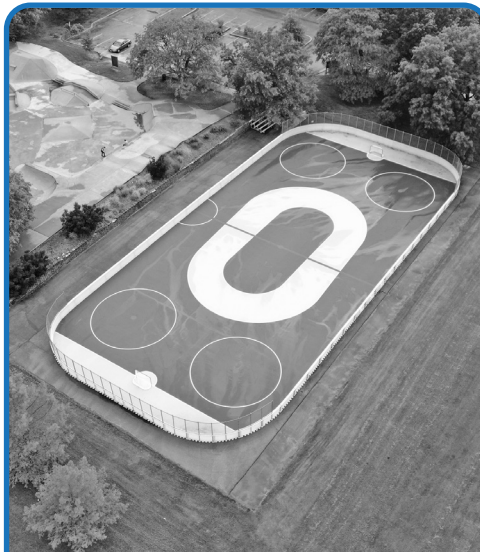
The outdoor roller hockey rink at Cosmo Park.

For more information, please contact Parks and Recreation at 573.874.7460.