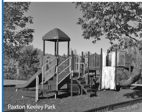
Paxton Keeley Park