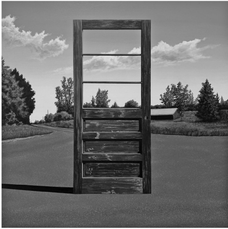
KEN NICHOLS | SOMETIMES IT'S A DOOR | ACRYLIC ON CANVAS

City of Columbia Commemorative Poster BICENTENNIAL 1821-2021