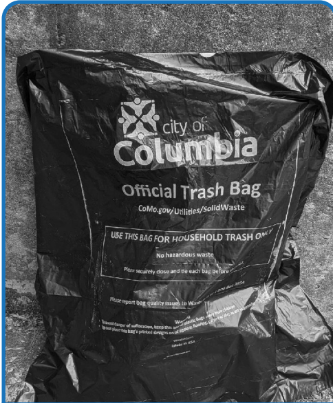
The vouchers can be redeemed at select merchants for official City branded trash and recycle bags.

City of Columbia Solid Waste residential curbside customers should begin receiving refuse and recycling bag vouchers in their mailboxes the week of June 14. In the June packet, customers will receive two vouchers for 26-count rolls of black refuse bags and one voucher for an 18-count roll of blue recycling bags. If customers do not receive their vouchers by June 25, they should contact the City's bag contractor, WasteZero, at 1.800.866.3954 or customerservice@wastezero.com . Vouchers will be mailed to the service address, regardless of who is paying for the Utilities.