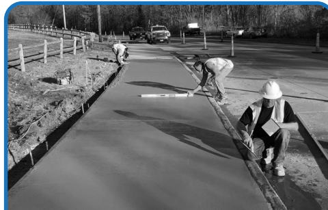
Crews worked to construct approximately 3,100 linear feet of concrete sidewalk to allow students safer access to the local high school.

The City of Columbia Public Works department completed the construction of the St. Charles Road Sidewalk project, which includes the construction of approximately 3,100 linear feet of concrete sidewalk and a crosswalk with a pedestrian flashing beacon connecting the existing sidewalk to the new sidewalk. This project provides students with a paved path to the local Battle High School.