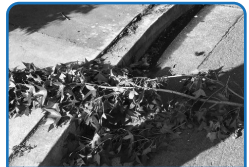
Brush obscures one of Columbia's many sidewalks.

Contact Neighborhood Services if we can help with an issue: 573.817.5050 or neighborhood@CoMo.gov .