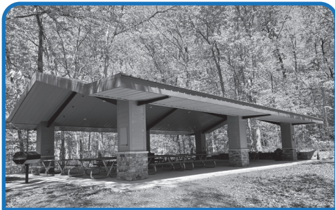
A renovated shelter seen at the recently improved Kiwanis Park in Columbia, MO.

Columbia Parks and Recreation has completed improvements at Kiwanis Park, 1001 Maplewood Drive.