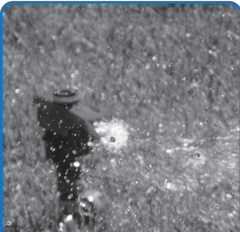
A sprinkler system can help conserve water use.

We all love the color of the flowers over the lush green lawns that we see every summer. That means lots and lots of watering.