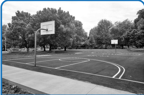
The restriped basketball courts at Again Street Park.

Columbia Parks and Recreation has completed capital improvements at Again Street Park, 1200 Again St.