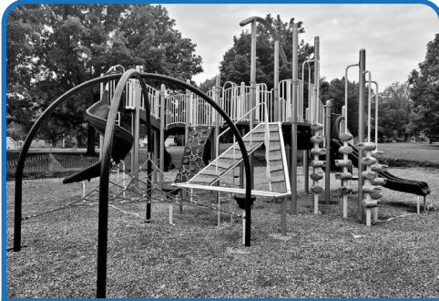
New playground equipment at Again Street Park.