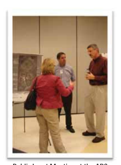
Public Input Meeting at the ARC

• 09/15/11 Maplewood Barn Community Theater Columbia Center for Urban Agriculture 09/20/11 and Columbia Garden Coalition Blue Thunder Track Club and Douglass 09/26/11 Athletic Association/Baseball 09/26/11 Columbia's Farmers Market 10/06/11 Diamond Council 10/07/11 Archery Enthusiasts 10/11/11 Skateboard Park Enthusiasts 10/11/11 Pickleball Enthusiasts 10/11/11 Boone County Historical Society City of Columbia Disabilities Commission 10/13/11