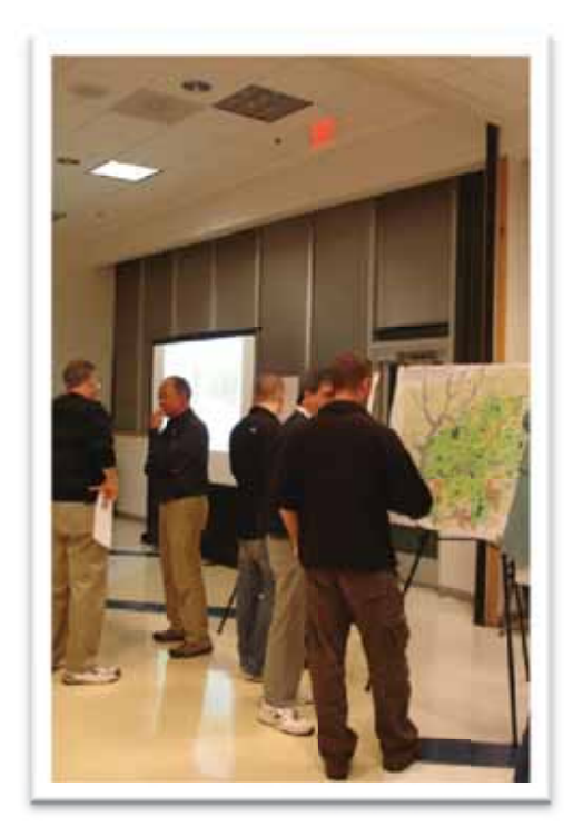
Public Input Meeting at the ARC

The Department works closely with local colleges and universities regarding the joint use of facilities. Columbia College and Stephens College uses Columbia Parks & Recreation Department's fields as their home for their softball programs. The University of Missouri is working with the Department on use of Cosmo-Bethel Tennis Courts as a practice site for hosting Southeastern Conference tournaments. In addition, MU Recreation uses numerous fields and facilities for their various club teams. In return, the Department utilizes facilities at the local colleges for leagues, tournaments and special events such as the Tiger Night of Fun Halloween event at the Hearnes Center. Communication between the local colleges and universities is ongoing with meetings planned as needed.