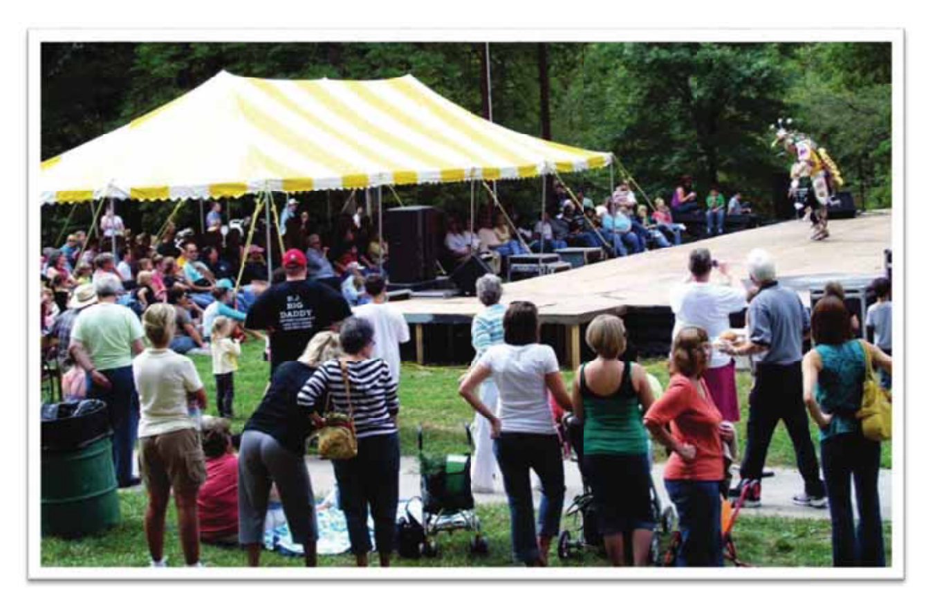
Heritage Festival at Nifong Park

Seventy-five percent (75%) of respondents live within Columbia city limits, while twenty-three percent (23%) do not. Additionally, two percent (2%) indicated they do not know, or did not answer. Regarding zip code, forty-five percent (45%) of respondents have a home zip code of 65203, followed by 65202 (27%), 65201 (18%), and other (10%).