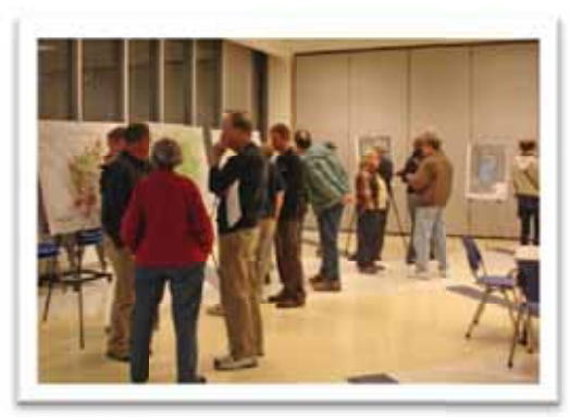
Public Input Meeting at the ARC

The second community-wide public input meeting was held March 15, 2012. The goal of this meeting was to solicit comments on the following planning documents: 2012 Draft Trails Plan, 2012 Draft Neighborhood Park Plan and lists of identified capital improvement projects for both existing facilities and facilities with an undetermined location.