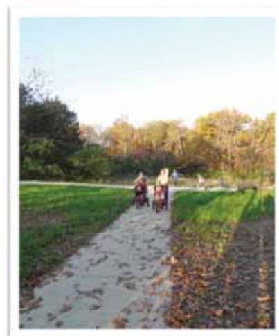
Fairview Connector Scott's Branch Trail to Fairview Elementary School