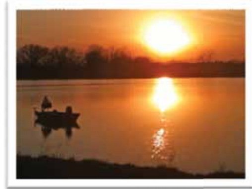
A. Perry Philips Park

The table below lists the parks in order of acquisition. The Department also completed the development (or phase I development) of ten of these parks.