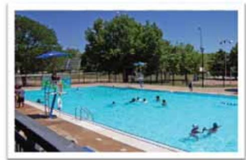
Douglass Pool Renovation

The following is a list of parks and facilities that the City owned or managed in 2002 and what projects have been accomplished at these facilities since then. Most of the items accomplished were identified as goals in the 2002 Facility Needs Update and some were added since 2002. Regular maintenance items and basic repairs are not included.