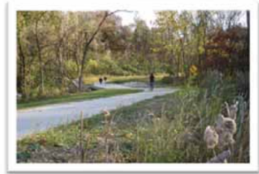
County House Trail

The acquisition of land for trails, greenbelts and open space is a critical component of maintaining a quality parks and recreation system. Many acquisitions are for future trail extensions or as buffer land to protect existing resources from encroachment. This following list does not include connecting trails or easements that were jointly acquired by other agencies or departments for sewer, water, electric or other utility easements. Listed below is a summary of trail or greenbelt properties that have been acquired by the Department since 2002.