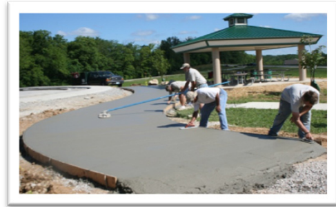
Park Construction Crew at Smiley Lane Park

Estimated costs as shown below represent contracted work, unless otherwise indicated as force account labor (FAL). Where (FAL) is shown, costs are for materials only.