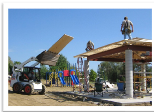
Park Construction Crew at Longview Park

Columbia Parks and Recreation has prepared lists of capital improvement projects by category, which are included in the sections listed below. These projects, based on information gathered during the public input stages, trend analysis, and combined with Department recommendations, represent capital needs that are anticipated during the next five to ten years. This information is used to determine development and acquisition priorities that are identified annually in the City's Capital Improvement Program.