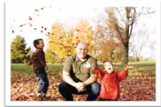
Stephens Lake Park

In its continuing effort to provide quality recreational opportunities, parks, trails and preservation of open space for its residents, the Columbia Parks and Recreation Department has created the 2013 Parks, Recreation and Open Space Master Plan . This plan serves as a guide for the development of parks and recreational facilities over the next ten years.