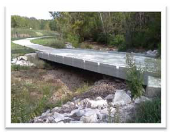
Low Profile Bridge at County House Trail

Free span bridges are the ideal method of crossing streams and creeks, where feasible. However, in some cases a low profile bridge could be appropriate. Often these span streams with low flow or in residential or commercial areas where a bridge itself is aesthetically intrusive. In these situations, low profile bridges have proven to be quite successful. Low profile bridges are economical, often costing in the $100,000-$200,000 range. However, for the purpose of calculating a standard cost per mile for trails, the use of low water bridges will not be included.