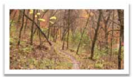
Rhett's Run Mountain Bike Trail

Asphalt is a hard surface material that is popular for a variety of rural, suburban and urban trails. It is composed of asphalt cement and graded aggregate stone. It is a flexible pavement and can be installed on virtually any slope. The asphalt trail should be coated with a special sealant, particularly where it is exposed to the sun for long periods of time. To reduce the unraveling of the pavement edges, the trail should be re-compacted periodically by a mechanical roller. Asphalt trails are impervious to water and can readily accommodate a variety of uses, as long as the trail remains in good repair. Asphalt trails are usually cheaper than concrete to install initially; however, they do not last as well and require more maintenance. The Department is not recommending asphalt as a surface for major destination trails.