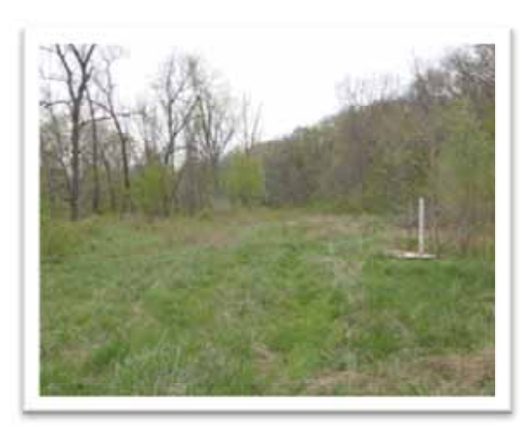
Bottom Land Stream Corridor with Sewer Utility Easement

The City of Columbia passed a Stream Buffer Ordinance in January 2007, which defined buffer areas and established appropriate uses. As identified in Section 12A-231 of Columbia's Code of