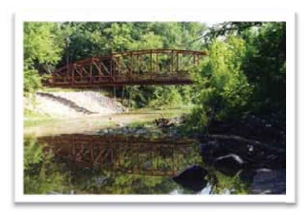
Free Span Bridge at Hinkson Creek Trail

The number of bridges needed for any particular trail development cannot be determined until the exact trail route has been decided. Trail planners try to keep a proposed