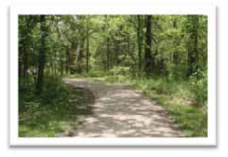
20-Year-Old Albert-Oakland Concrete Trail