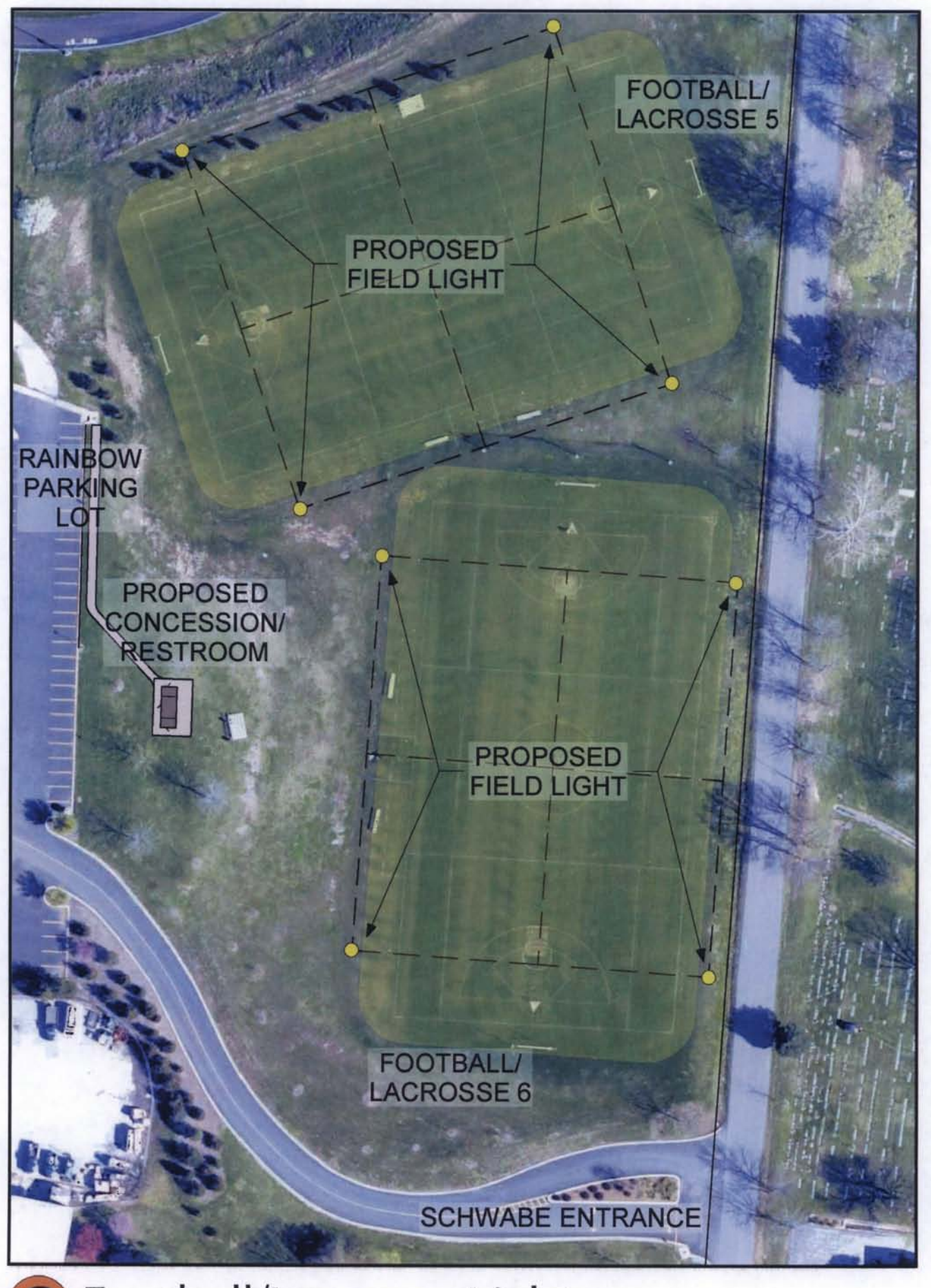
Football/Lacrosse Lights 0' 20' 40' 60' N