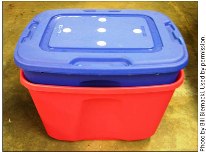
Figure 2. Vermicomposting bin system showing arrangement of two plastic totes stacked together. The first tote (the top one) is the vermicomposting bin. It has the ventilation holes and is the one that houses the worms.

To build this system, choose two sturdy, opaque plastic totes (with tops) of the same size (14-gallon is a good size to start with). The first tote is the vermicomposting bin (or worm bin) (figure 2). It nests inside the second tote, which collects any leachate (liquid residue) (figure 3) from the composting process. Note the spacers at the bottom