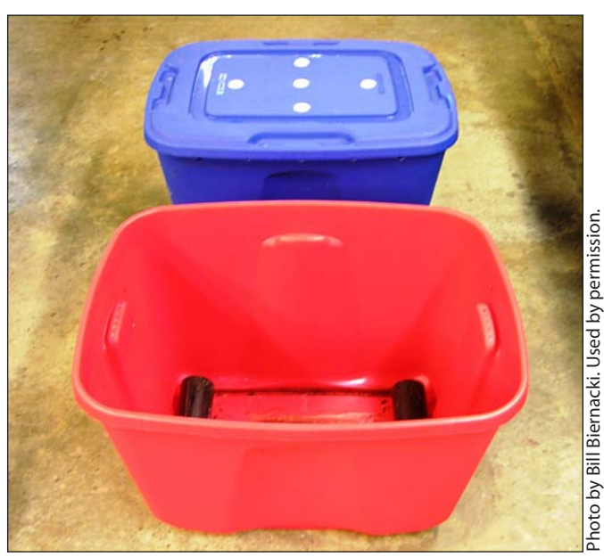
Figure 3. In a vermicomposting system, leachate collects in the bottom plastic tote. Note the two plastic blocks set inside the bottom that help prevent the two totes from sticking to one another. This makes it easier to separate them for maintenance and cleaning.