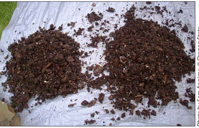
Figure 16. The first step in the "dump and sort" method for harvesting vermicast. On a tarp in the sun or under a bright light, divide the contents of the bin into small, cone-shape piles.

Move the worm bin contents to one side of the bin so it fills about ¾ of the bin's volume. Add fresh bedding and food to the empty section. Let the new section stand for 2 to 4 weeks without adding fresh food to the old section.