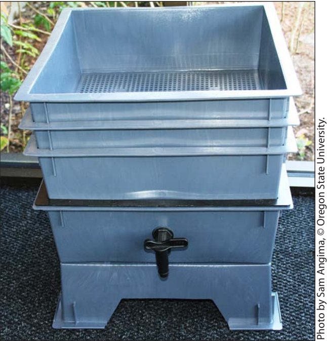
Figure 8. A commercial stacking tray system. Starting from the bottom, a series of trays are filled sequentially with food. As worms move upwards to fresh bedding and food, vermicast can be harvested from the bottom trays.

If you paint the outside of your bin, leave the inside unpainted. White paint on the outside of the bin helps reflect light, keeping the worm bin cool in summer.