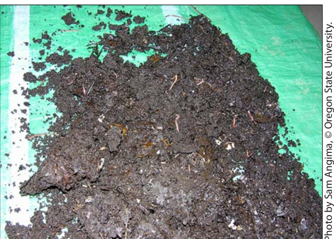
Figure 15. Vermicast is a mixture of worm castings and decomposed organic matter.

Vermicompost or vermicast is a mixture of worm castings and decomposed organic matter (figure 15). It can be very wet at harvest time depending on the kitchen waste you use (for example, lots of banana and fruit peels). If you wish to use a sieve to make debris-free compost, then allow the vermicast to dry first.