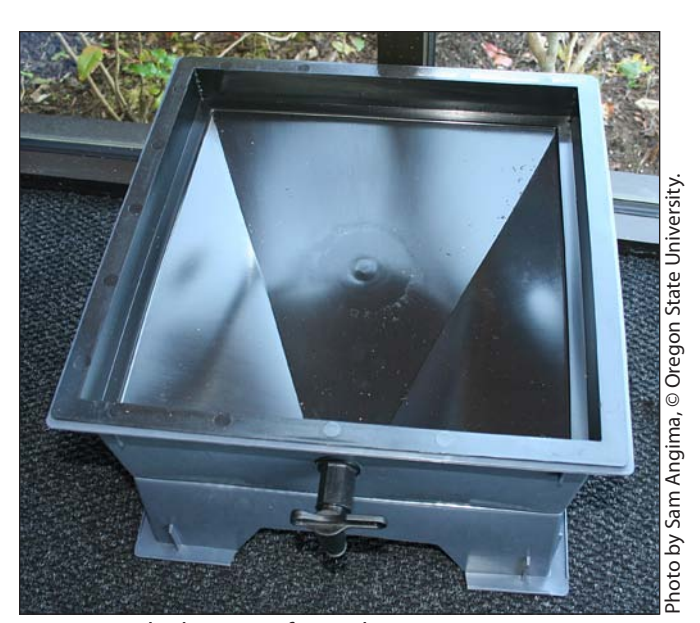
Figure 10. The bottom of a stacking tray system is designed to capture leachate and allow its easy removal with a spout.