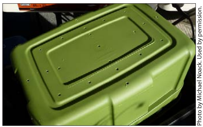
Figure 4. Drill up to 20 ¼-inch drainage holes in the bottom of the first tote. Notice that most of the holes are drilled in what are the lowest places on the tote's bottom. Leachate drains down to the lowest areas and out, so it won't stagnate in the worm bin.

The stacking tray system operates on the fact that worms follow food. Put bedding and worms in the bottom tray along with food scraps (figure 8, page 5). Once the food scraps are converted to compost, the worms look for a new source of food. Stack a new tray of fresh bedding and food scraps on top of the first tray. The worms wriggle their way through small holes in the bottom of the top tray (figure 9, page 5) to get to the food above. You harvest the compost in the first tray, and keep stacking new trays on top. Most have a drainage tray (figure 10, page 5) at the very bottom to collect leachate.