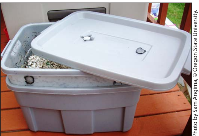
Figure 1. Two 14-gallon plastic totes, modified to make a worm compost bin. Notice the ventilation holes lined with fine mesh screen to prevent small flies from getting in and worms from getting out.

A 14-gallon worm bin measuring 1 foot deep by 1 foot wide by 2 feet long (1' x 1' x 2') gives you 2 cubic feet of volume, space for 2 to 2½ pounds of worms (see figure 1). A system this size can process 2 pounds of kitchen waste per week, approximately what the average family of two or three produces. A family of four to six would need a larger bin— 6 cubic feet (1' deep x 2' wide x 3' long)—and more