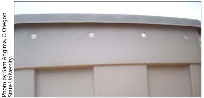
Figure 6. If commercial vents are not available, drill up to 10 ¼-inch holes on the sides, 2 to 3 inches below the lip of the tote. You can glue screen material to the holes to prevent fruit flies from invading the system.