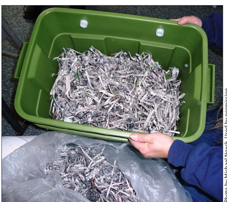
Figure 12. Always use hand- or machine-shredded newspaper or recycled printer paper. Do not use glossy paper or cross-cut shredded paper.