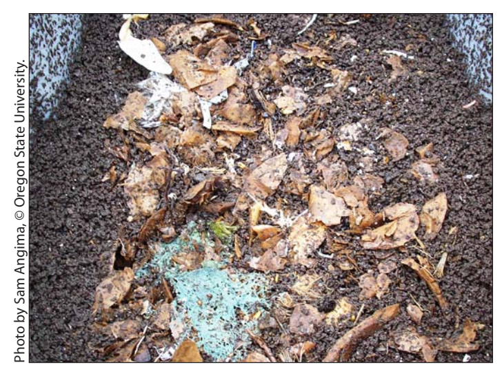
Figure 14. In this finished vermicast, you can see that the worms did not consume the potato peels. Whenever possible, avoid putting potato peels in the worm bin. They contribute to anaerobic conditions in the bin. (The greenish material is colored paper towel, which worms do consume.)