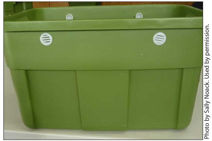
Figure 5. Commercial vents fit into 1-inch holes.