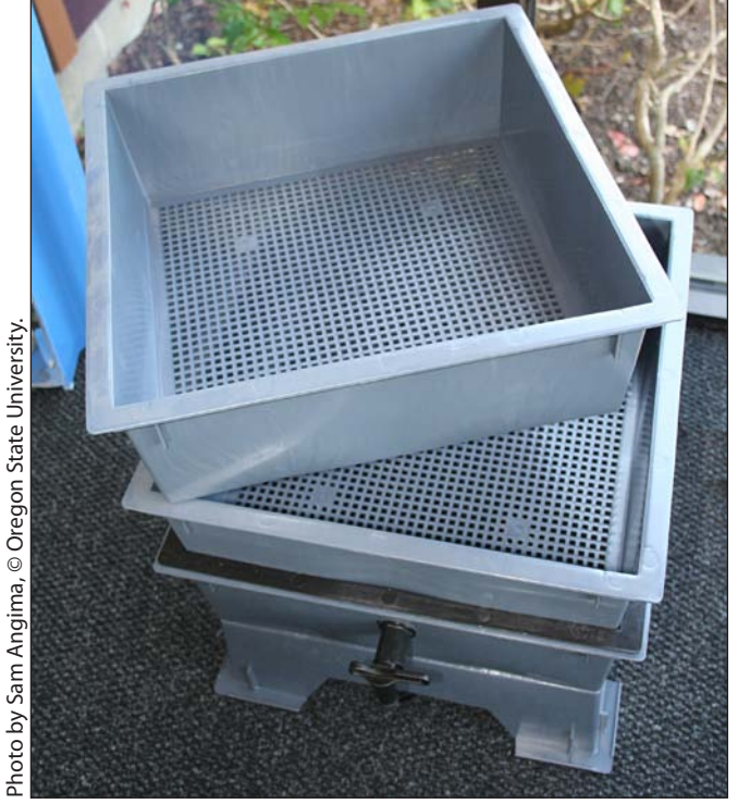
Figure 9. The trays in a stacking system are removable and have holes large enough to allow worms to move freely from one tray to the next.