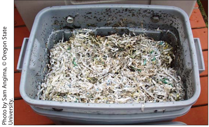
Figure 13. Always keep a 2-inch layer of fresh bedding over the worms and food in your bin.

Worms need 75 to 85 percent moisture in their bedding. Mix the dry materials together, then sprinkle them with water and continue mixing and adding water until the mixture feels like a wrung-out sponge (when you squeeze it in the palm of your hand, only a few drops come out).