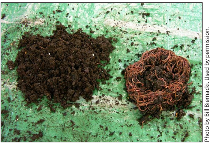
Figure 17. The pile on the right shows the last step in the "dump and sort" method, in which only the worms remain. The pile on the left has not been harvested.