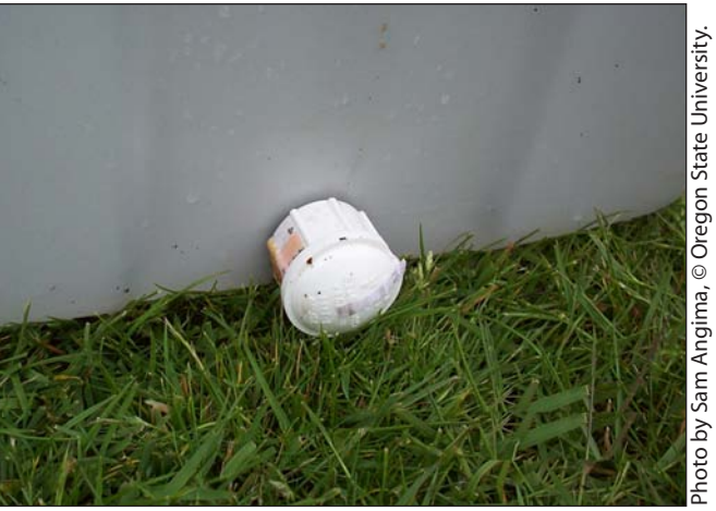
Figure 7. You can install a drain plug on the second bin to make it easier to drain leachate.