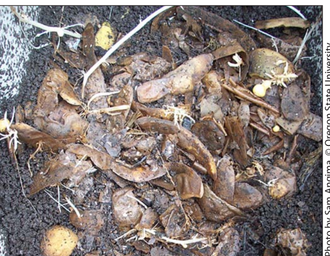
Figure 18. Because worms don't digest seeds, you may get volunteer seedlings, especially if the bin is left for a while without active feeding (such as when you are preparing to harvest vermicast).

• Anaerobic bacteria caused by poor drainage, especially if holes at the bottom of the bin are clogged. If there is too much moisture in the