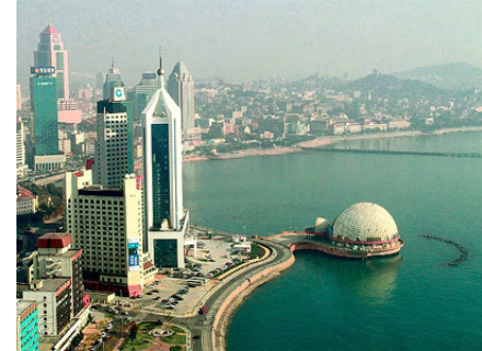
A view of the Qingdao city skyline