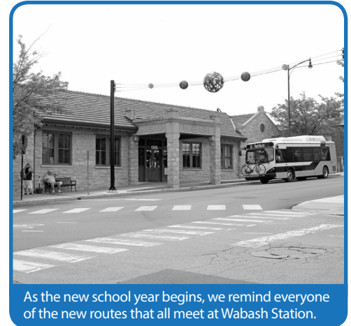
As the new school year begins, we remind everyone of the new routes that all meet at Wabash Station.

Check out our free Go COMO app, or visit our website, GoCOMOTransit.com , to see the new routes, the bus stops, and a live feed of where the buses currently are.