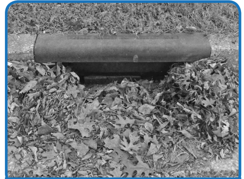
When leaves or grass clippings make their way into our storm drains, they can clump with other debris and block inlets and pipes.