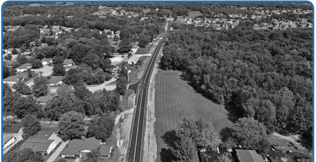
Nearly a thousand dump truck loads of fill were used to widen Ballenger Lane so that the shoulders could be added to improve safety.

The fiscal year 2020 budget runs until Sept. 30, 2020. To view the budget, and other City financial documents, visit CoMo.gov/Finance/Accounting/Financial-Reports .