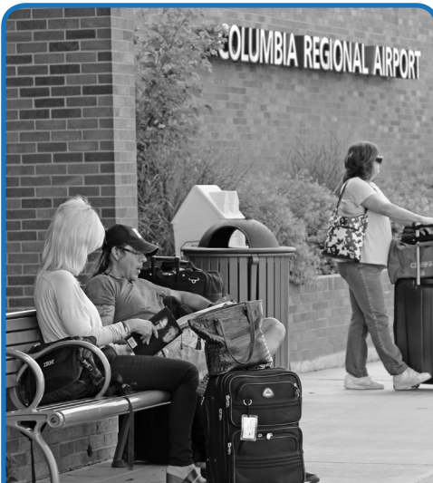
The Columbia Regional Airport continues to see an increase in the number of people flying in and out. Check out the COU news and updates to stay informed about airport projects.

Columbia Regional Airport (COU) continues to see an increase in the number of people flying in and out, with an annual average growth rate of 30% enplanements and deplanements between the years of 2007 and 2018.