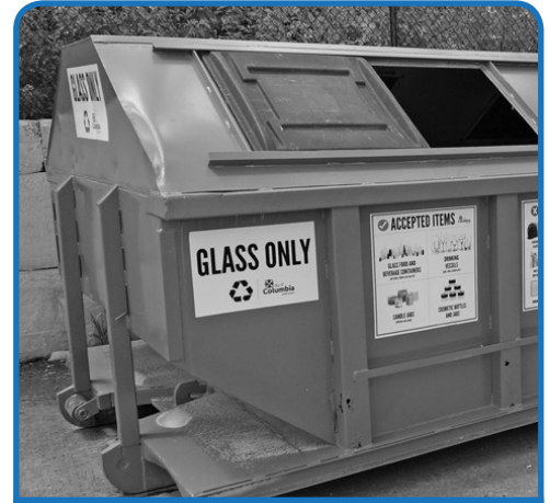
A new glass only recycling container has been placed at the State Farm Parkway Recycle Center.

View a list of all recycling drop-off centers and view an interactive map of locations at CoMo.gov/Utilities/Solidwaste/Recycling-Drop-Off-Centers .