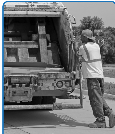
City of Columbia offices will be closed for Thanksgiving Day, the day after Thanksgiving, Christmas Day and New Year's Day.

Please visit CoMo.gov/utilities for phone numbers to contact staff regarding emergencies related to Water & Light, Sewer and Stormwater.