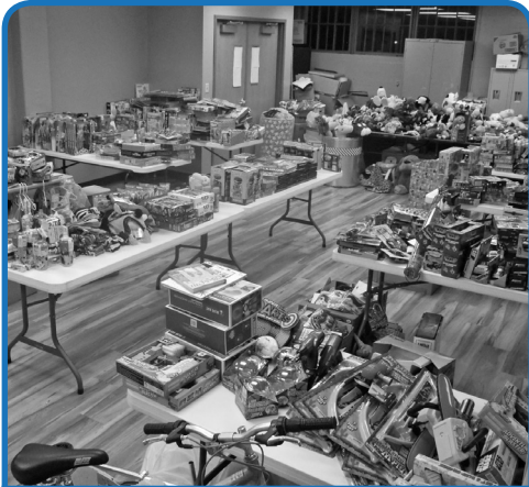
In 2017, more than 250 children received toys for the holidays through the Almeta Crayton Memorial Toys for Columbia Youth Drive.

Columbia Parks and Recreation is organizing the annual Almeta Crayton Memorial Toys for Columbia Youth Drive. Families interested in applying for the program may do so by Monday, Dec. 10. The toy drive serves children ages 12 and under. To be eligible, families must be Columbia residents, meet income requirements and not be receiving toy assistance from another agency.