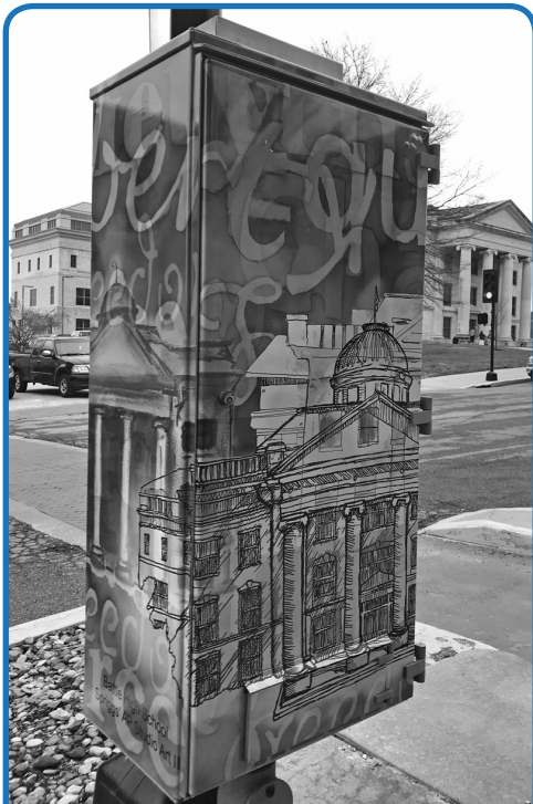
Artwork from students at Battle High School was installed as a vinyl wrap on the traffic signal box at Seventh and Walnut streets.

Please visit CoMo.gov/Utilities/Uncategorized/Water-Rate-Structure for billing examples highlighting water usage patterns among different types of customers. These examples show how summer water bills will be configured with the new water rate structure. You will also find additional resources, water conservation tips and programs on the website. For assistance and questions, please call the City's Contact Center at 573.874.CITY (2489).