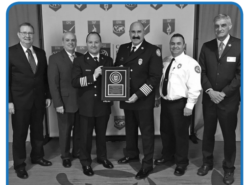
The Columbia Fire Department was awarded certification as an "Accredited Agency" by the Commission on Fire Accreditation International. Less than 1% of fire departments nationwide are accredited.

CFAI has 11 members that represent a cross-section of fire and emergency services including fire departments, city and county management, labor, standards development organizations and the U.S. Department of Defense. CFAI holds public hearings at the Center for Public Safety Excellence Conference each spring and at the International Association of Fire Chief's Fire-Rescue International each summer to review agencies.