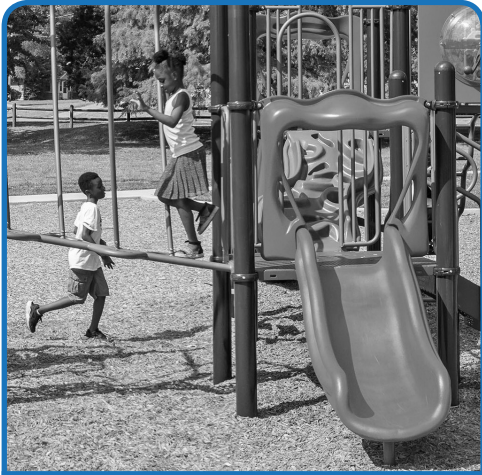
The playground at Douglass Park is one of the destinations for Parks and Recreation's Playground Challenge.

Take the Playground Challenge with Columbia Parks and Recreation this summer!