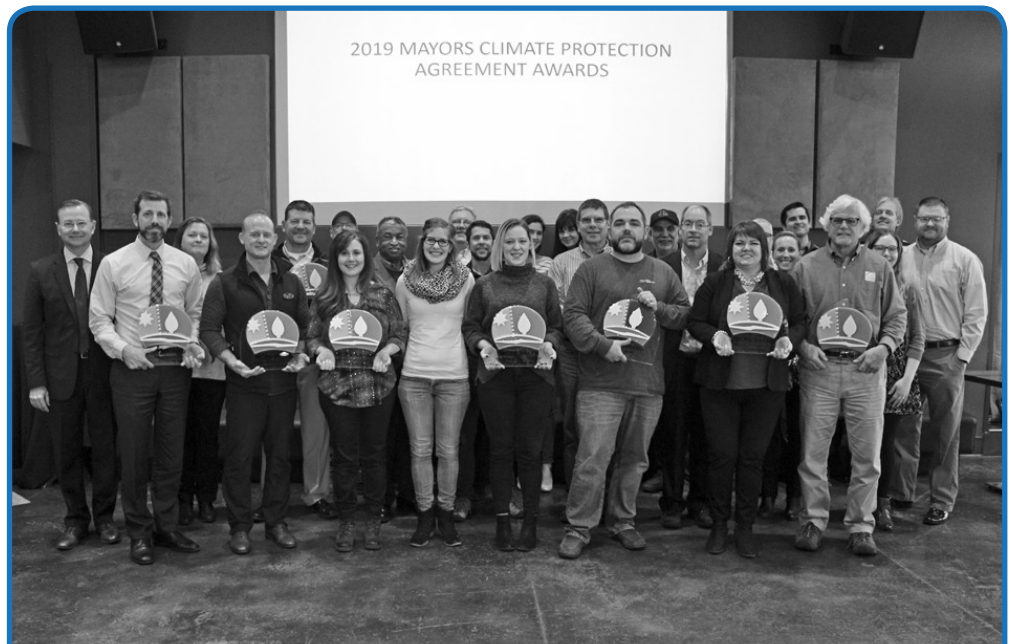
Businesses and organizations were named as winners of the 2019 Mayor's Climate Protection Agreement awards for taking action to reduce environmental impacts, champion sustainable practices and promote a culture of environmental responsibility.