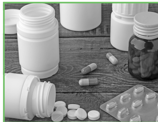
The Columbia Fire Department responded to 354 poisonings/drug ingestion calls in calendar year 2016.