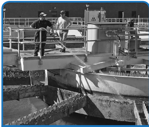
Columbia's McBaine Water Treatment Plant.

The City of Columbia recently released the 2018 Water Quality Report. The report shows that Columbia's drinking water meets or exceeds all quality standards set by the Federal Environmental Protection Agency, and is in compliance with the Safe Drinking Water Act and the Missouri Department of Natural Resources. Columbia Water & Light runs more than 4,000 tests each year on samples from over 30 locations.