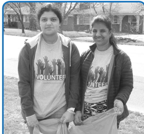
Staff members from Shelter Insurance participate in Cleanup Columbia by picking up near their facilities.

To learn more about volunteering with the City of Columbia, contact Volunteer Programs at 573.874.7499 or Volunteer@CoMo.gov.