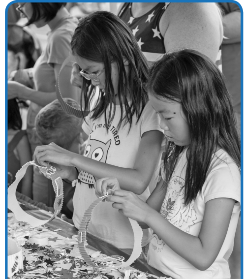
Kids will enjoy a variety of activities and games at Flat Branch Park.

In addition to presenting sponsors Columbia Insurance Group and KOMU 8, Fire in the Sky is sponsored by KBXR 102.3, KFRU 1400, Columbia Convention and Visitors Bureau, First State Community Bank and Columbia Cosmopolitan Luncheon Club