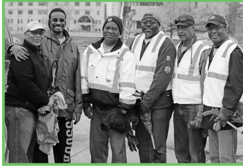
Members of Minority Men's Network spent their Saturday morning participating in Cleanup Columbia.