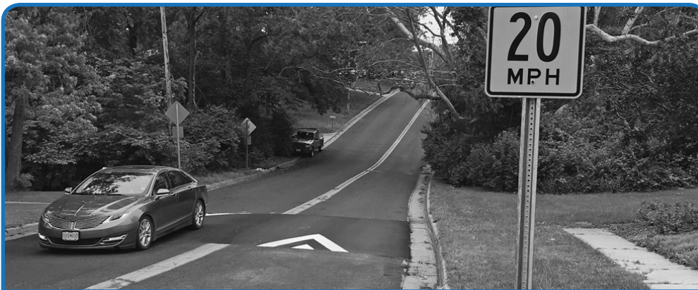
Two speed tables and two speed humps were installed on Primrose Drive to slow traffic as part of the City's Neighborhood Traffic Management Program. Primrose Drive was No. 4 on the 2017 Neighborhood Traffic Management Program scoresheet.