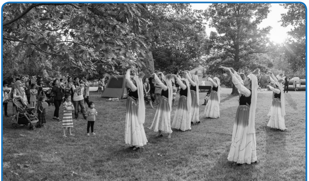
Talented artists will share their culture and perform at Family Fun Fest at Cosmo Park Aug. 21.

The Family Fun Fest series is sponsored by the Columbia Convention and Visitors Bureau, KPLA 101.5 Radio, KOMU 8, ParentLink and Tigers Community Credit Union.