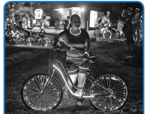
Participants are encouraged to decorate their bicycles in glow items for the Kaleidospoke bike ride on Aug. 17.

Please call Parks and Recreation at 573.874.7460 to register.