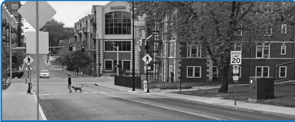
To improve the safety of students crossing Walnut Street on the Stephens College campus, a speed table was installed just west of Melbourne Street in combination with a flashing beacon that was installed last year by Columbia Public Works.

Despite a rainy spring, the City of Columbia Public Works Street Division completed five City Council-approved traffic calming projects.