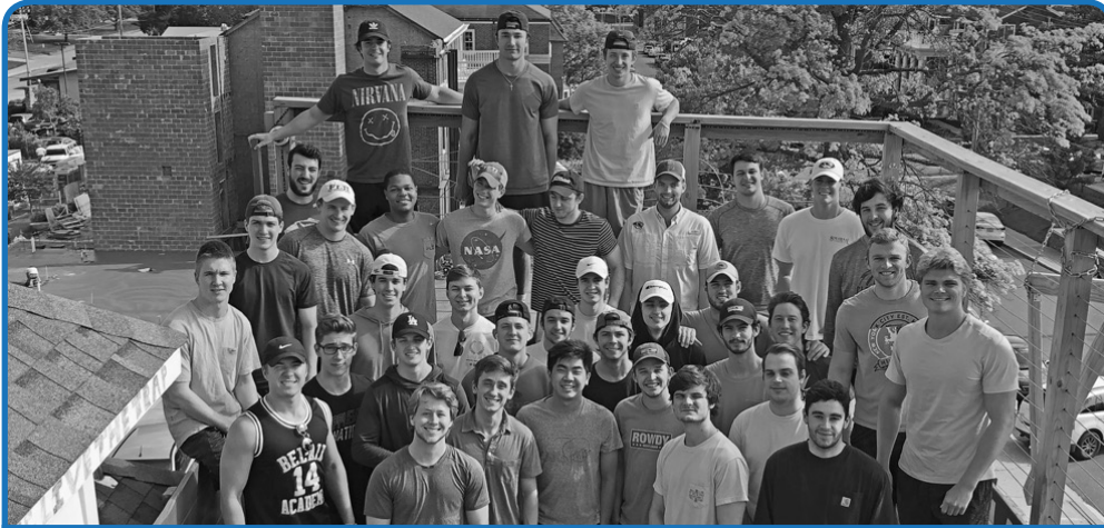
Phi Gamma Delta Fraternity

Phi Gamma Delta Fraternity is recognized as July's Volunteer of the Month for their tireless dedication to volunteerism in our community.