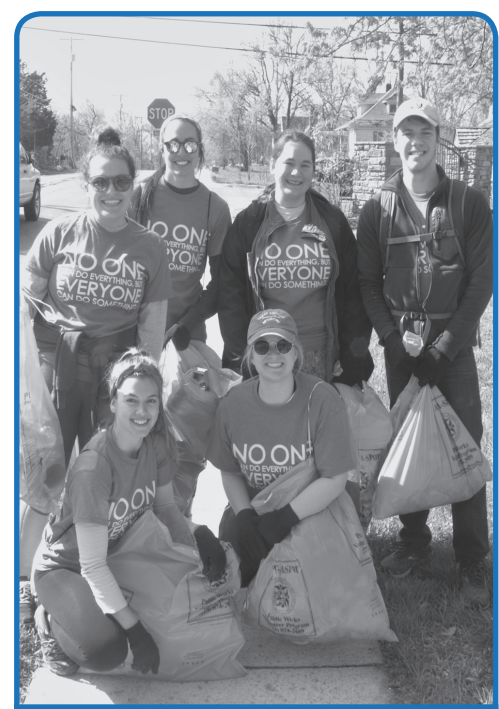
Members of the Association for Mizzou Public Affairs were some of the more than 1,800 volunteers who volunteered for Cleanup Columbia last year. The group picked up litter along West Boulevard.

To register, visit CoMo.gov or call Volunteer Programs at 573.874.7499.