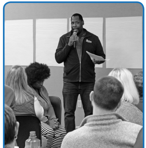
City Council, City department directors, participating front line staff and the Strategic Plan Planning Committee met Jan. 16 to make decisions about the 2020 Strategic Plan.

Updates will be posted on CoMo.gov/Strategic-Plan as they are available.