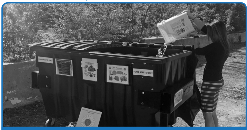
Columbia resident empties household food waste into drop-off container at Capen Park. We invite you to join us for the education events being held during International Compost Awareness Week.

Community members are invited to attend several events being held during International Compost Awareness Week May 5-11.