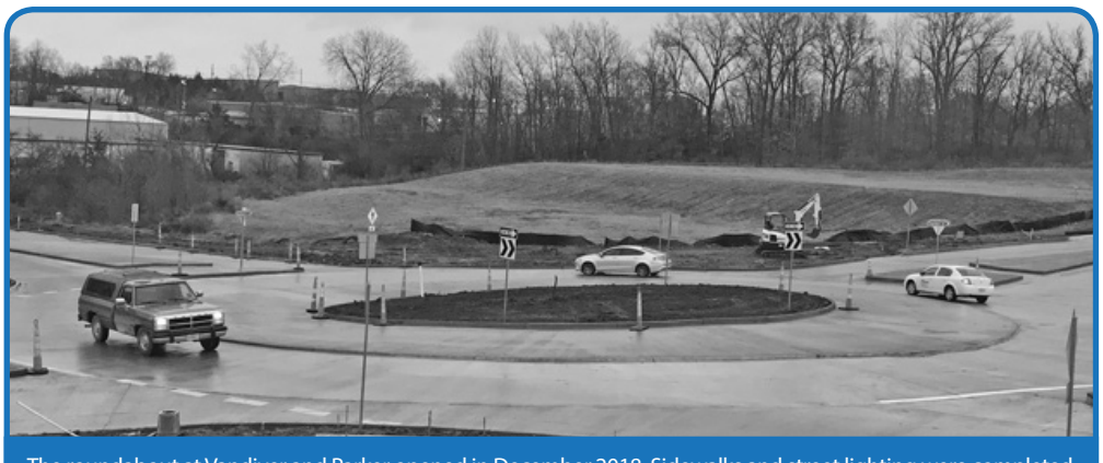
The roundabout at Vandiver and Parker opened in December 2018. Sidewalks and street lighting were completed in January 2019.

The City of Columbia's newest roundabout opened at Vandiver Drive and Parker Street in December 2018. Street lighting and sidewalks were completed in January 2019. The roundabout, which has a truck apron to accommodate larger commercial vehicles and buses, also included leveling the street and installing splitter islands and crosswalks. Landscaping of the center island will be done by private volunteers as weather permits.