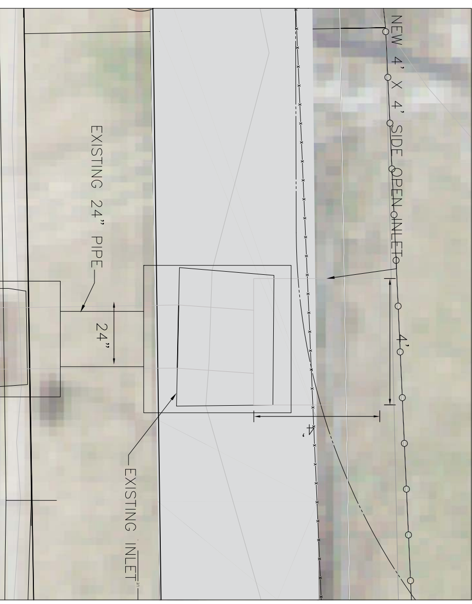
DETAIL 6: INLET A INFORMATION (NOT TO SCALE)