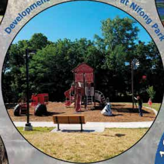
Development of Cosmo Corner at Nifong Park