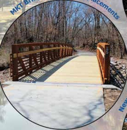
MKT Bridges 5, 7, & 8 Replacements