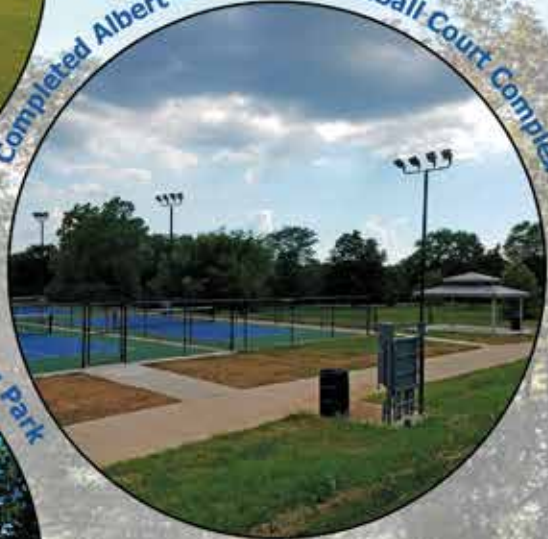
Completed Albert-Oakland Pickleball Court Complex