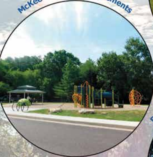
McKee St. Park Improvements