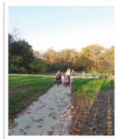
Fairview Connector Scott's Branch Trail to Fairview Elementary School