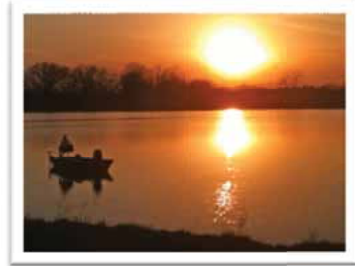
A. Perry Philips Park

One of the most significant priority needs identified in the 2002 Facility Needs Update was the need to acquire a second regional park. The City was able to accomplish this with the acquisition of the two parks: A. Perry Philips Park and the Gans Creek Recreation Area. Together, these two parks represent a 460-acre regional park in southeast Columbia that complements the 533-acre Cosmo Park in northwest Columbia. In addition to the regional park, the department was able to acquire three community parks (Atkins, Strawn and Battle) and nine neighborhood parks.