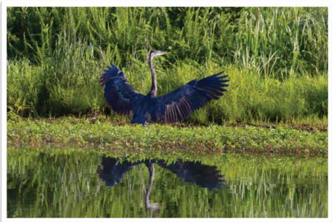
Crane at Garth Nature Area