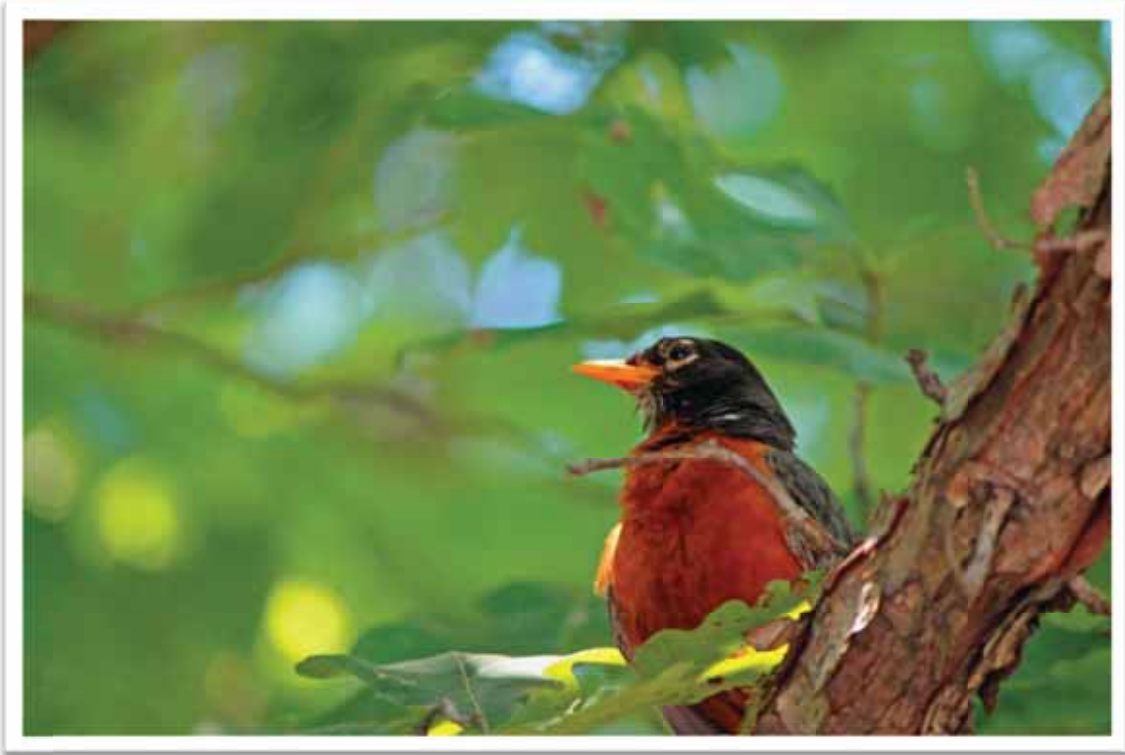
Robin at Forum Nature Area