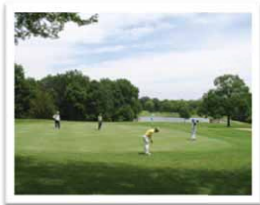
Lake of the Woods Recreation Area

There are currently no recommended acquisition areas for community parks. The existing community parks are well distributed throughout Columbia and there is ample undeveloped park land to accommodate athletic fields, reservable shelters and other amenities typical of