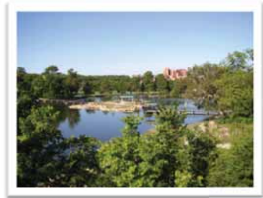
Stephens Lake Park

Community parks provide a variety of individual and organized recreation activities conveniently located for short-term visits. Community parks may be located in residential neighborhoods and suburban areas. The service area for community parks generally extends up to 3 miles. The park size typically will be 15-100 acres, serving several neighborhoods.