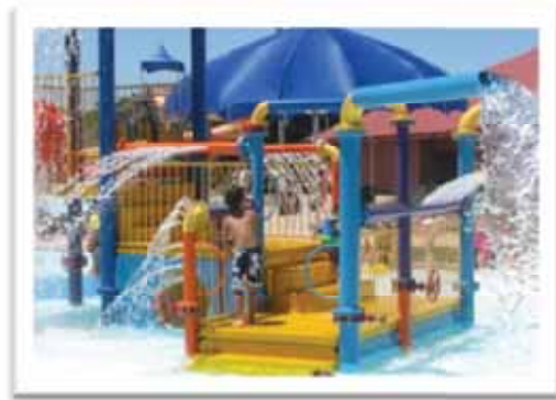
Albert-Oakland Family Aquatic Center

Currently, the 17 parks classified as Community Parks are: Albert-Oakland, American Legion, Atkins, Battle Avenue (undeveloped), Clary-Shy, Cosmo-Bethel, Douglass, Fairview, Indian Hills, Kiwanis, Lake of the Woods Recreation Area, Philips, Rock Quarry, Smith (undeveloped), Stephens Lake, Strawn Road (undeveloped), and Twin Lakes Recreation Area.