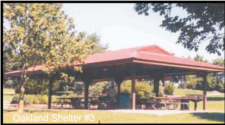
Oakland Shelter #3