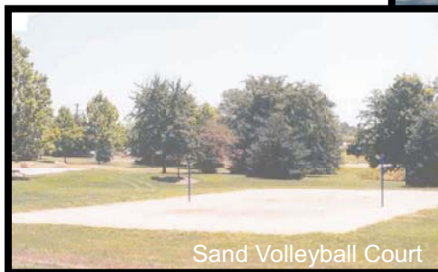
Sand Volleyball Court