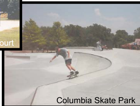
Columbia Skate Park