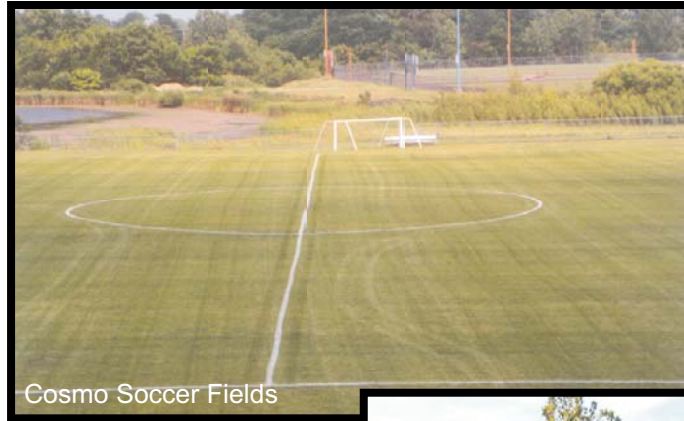
Cosmo Soccer Fields