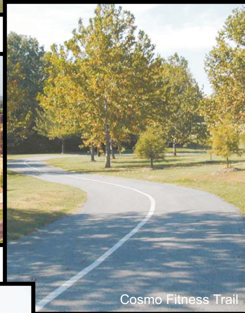
Cosmo Fitness Trail