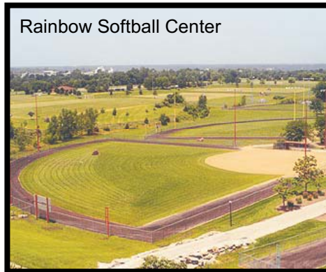
Rainbow Softball Center