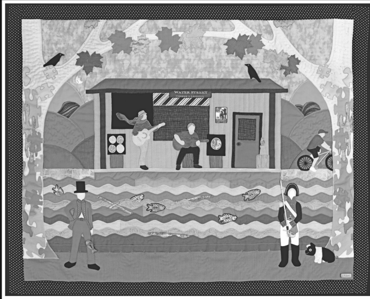
DEB ROBERTS | COOPER'S LANDING | FIBER CITY OF COLUMBIA COMMEMORATIVE POSTER 2014 POSTER SPONSOR: COMMERCE BANK | PRINTING SPONSOR: WALSWORTH PUBLISHING CITY OF COLUMBIA OFFICE OF CULTURAL AFFAIRS | COLUMBIA DAILY TRIBUNE | DECK THE WALLS