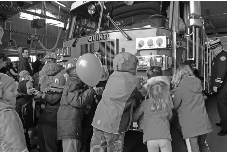
Attendees assist with “housing” Quint 9 in Station 9 by pushing the truck into the apparatus bay.

Lawn tips Yard waste deposited in the street affects the efficiency of the City’s street sweepers. Please keep yard waste out of gutters and streets.