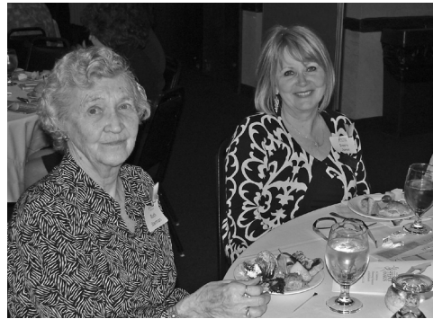
Boone Landing residents were nominated for the 2010 HERO Award.