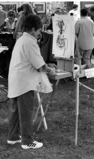
above: Entertainment at the Heritage Festival will include authentic American Indian dancing.

Call 874-7460 for more information or visit www.GoColumbiaMo.com (GoWord: GoHeritageFestival).