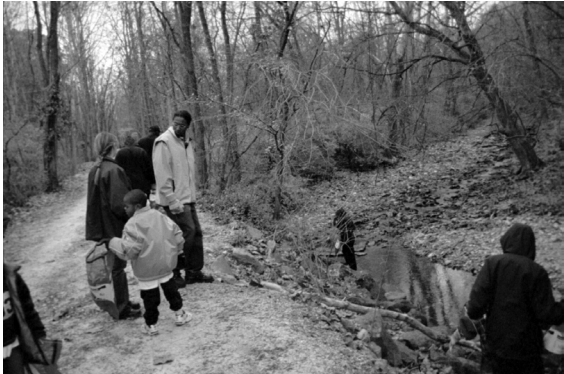
(above): Members of the Fun City Youth Academy clean up the Flat Branch Creek along the MKT.

For more information on how you can volunteer, call 874-7499 or visit www.GoColumbiaMo.com , GoWord: Volunteer.