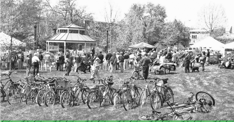
The Kickoff Celebration at Flat Branch Park