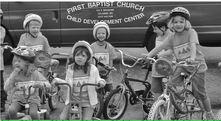
Young cyclists proudly show off their free T-shirts

Breakfast Station Day throughout Columbia, 7-9 a.m. Everyone who participates will receive a free T-shirt, while supplies last. For more information, call 442-7189, ext. 29, or check out getaboutcolumbia.com . Please plan to support this event and bike, walk or wheel — see how good it makes you feel!