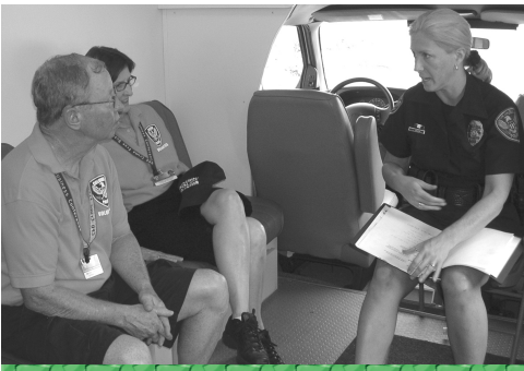
Police volunteers learn about their new assignment

The Columbia Police Department would like to thank its volunteers for their service to the community. Last year, volunteers donated hundreds of hours to the Columbia Police Department and our city. The Columbia Police volunteers, reserve officers, Neighborhood Watch and cadets are to be commended for their hard work. Volunteers help make Columbia a safer place to live.