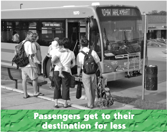
Passengers get to their destination for less

You can access information regarding disaster planning, natural disasters, Homeland Security bulletins and the local emergency operations plan from www.GoColumbiaMo.com/EM , provided by the Columbia/Boone County Office of Emergency Management. (Tenemos información en español.)