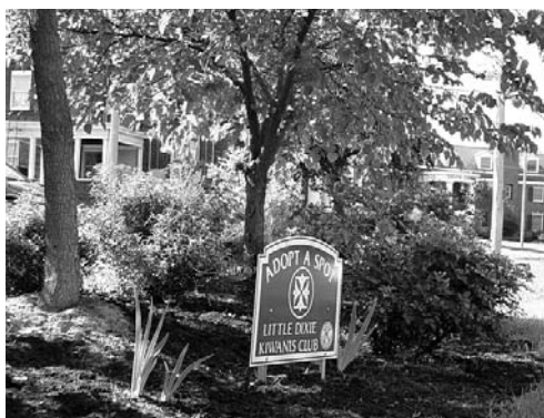
Little Dixie Kiwanis maintains this attractive Adopt A Spot Beautification bed near the MU campus on Providence Road.

Copies are available at the Columbia Public Library and at the Finance Department, 701 East Broadway. The budget can also be viewed on the City's web site at www.GoColumbiaMo.com .