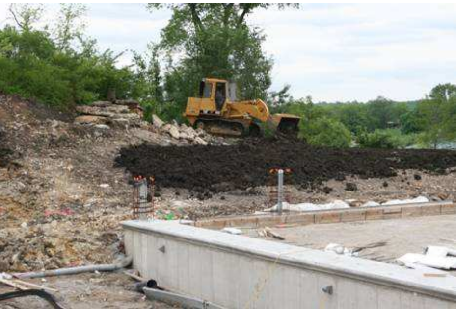
Earthwork to restructure surface prior to re-seeding turf