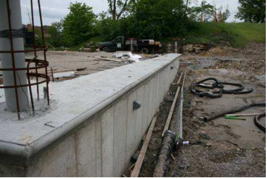
Amphitheater base filled with waste rock