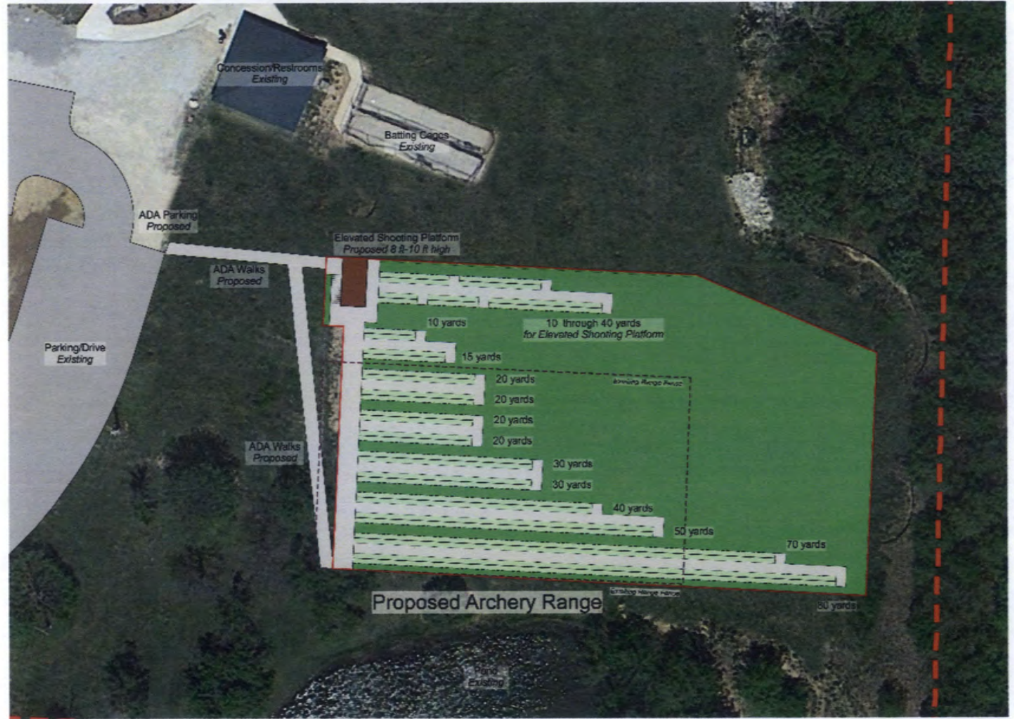
Archery Range Improvements 20 scale N