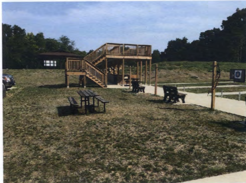
Deck for practicing elevated target shooting Busch Memorial Conservation Area Shooting Range