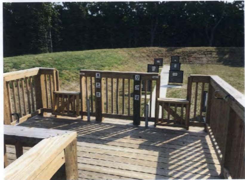
Targets from deck Busch Memorial Conservation Area Shooting Range