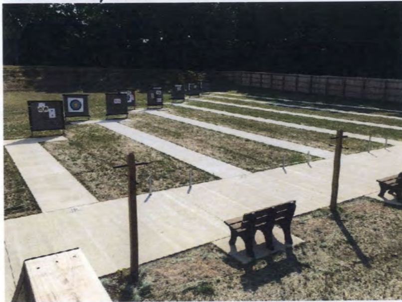
Targets ranging from 10 yards to 40 yards Busch Memorial Conservation Area Shooting Range