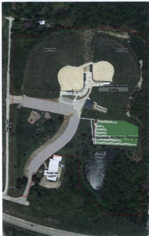
American Legion Park 100 scale N