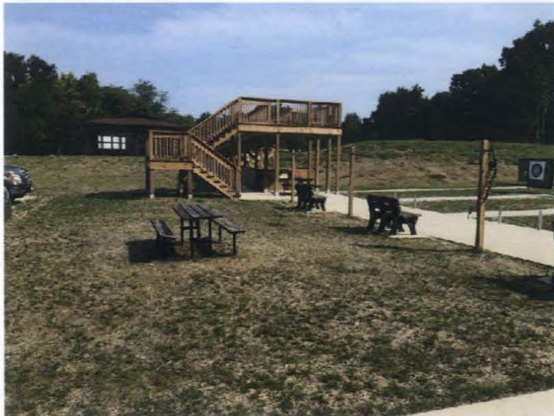
Deck for practicing elevated target shooting Busch Memorial Conservation Area Shooting Range