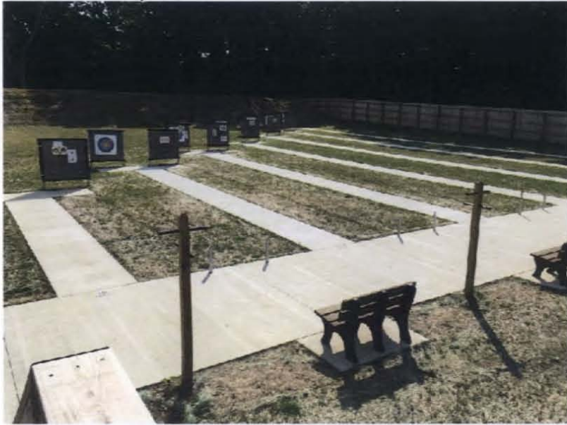
Targets ranging from 10 yards to 40 yards Busch Memorial Conservation Area Shooting Range