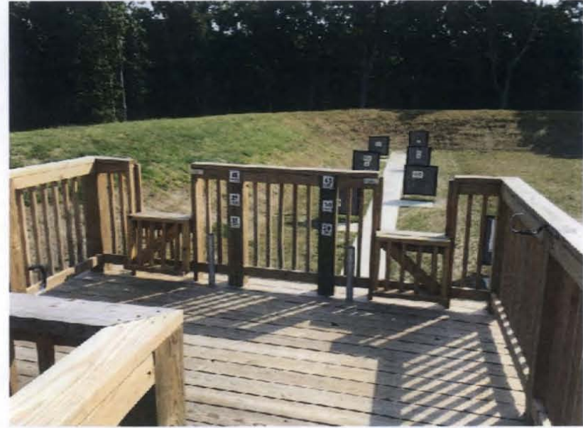
Targets from deck Busch Memorial Conservation Area Shooting Range