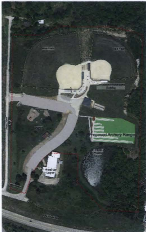
American Legion Park 100 scale N