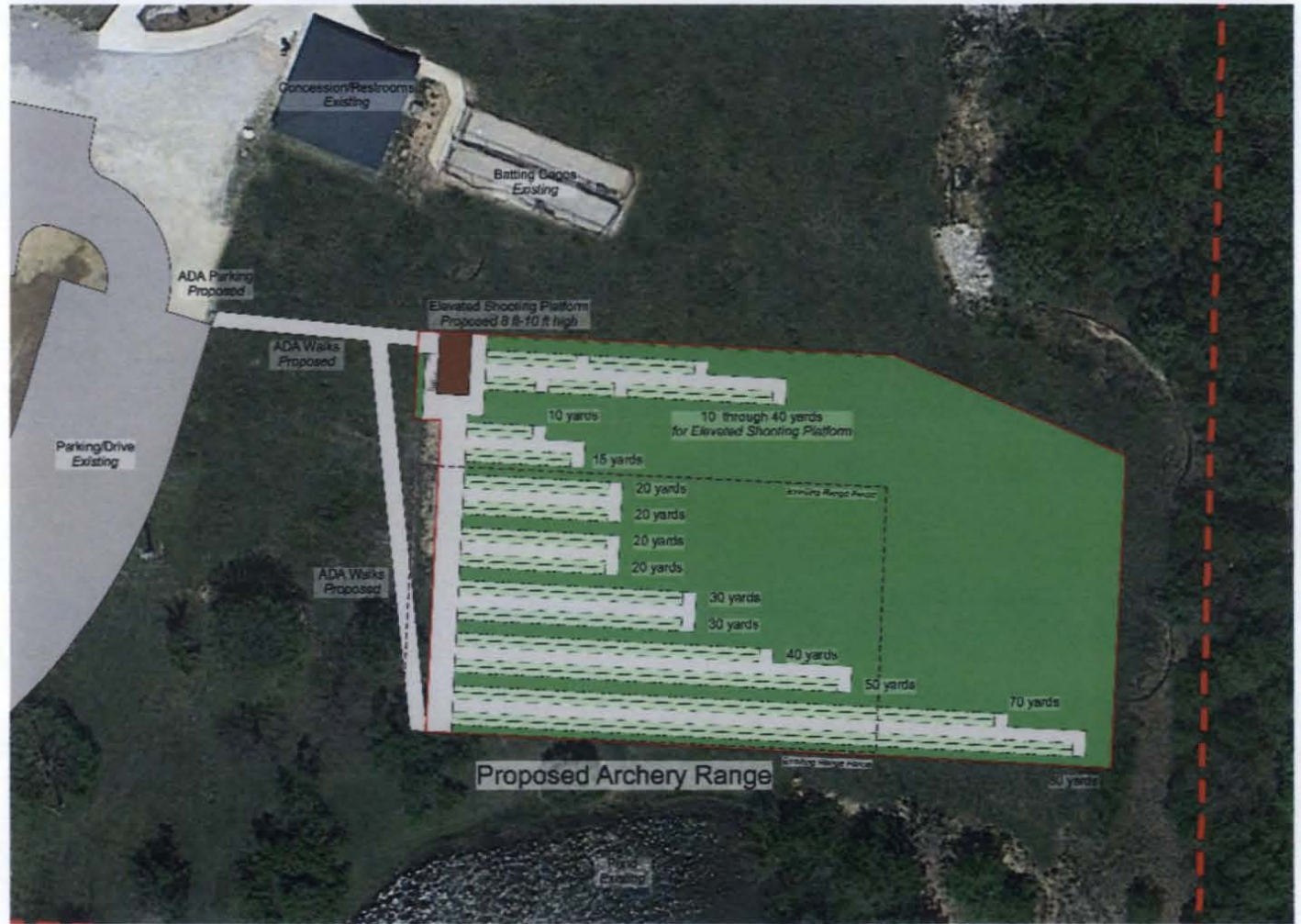
Archery Range Improvements 20 scale N