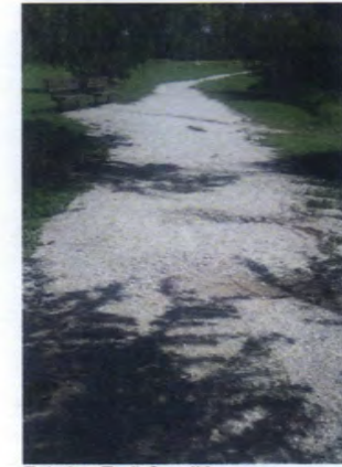
Existing Trail Conditions