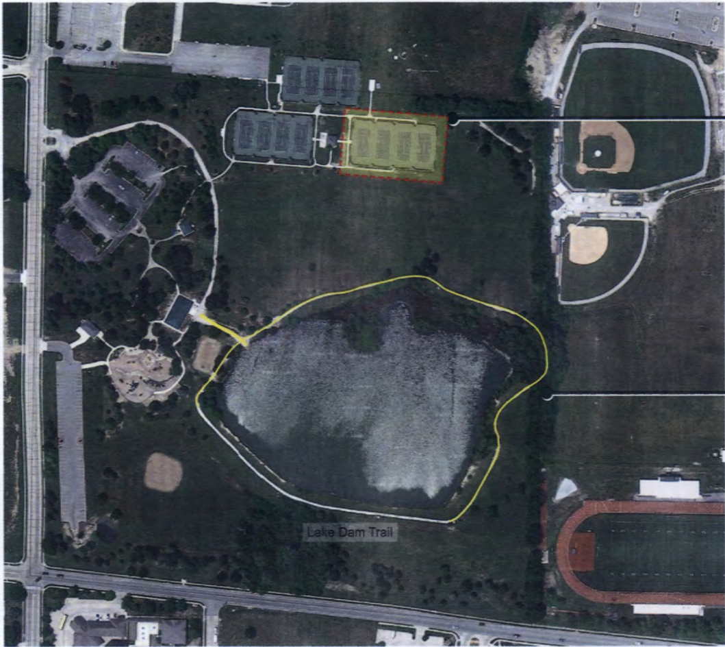
Cosmo Bethel Park