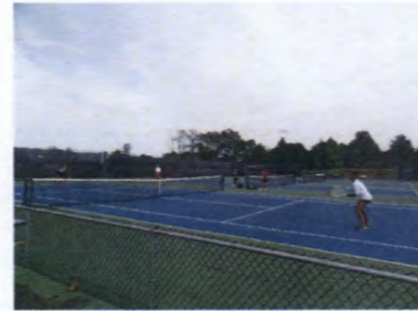
Lighting Last Four Tennis Courts