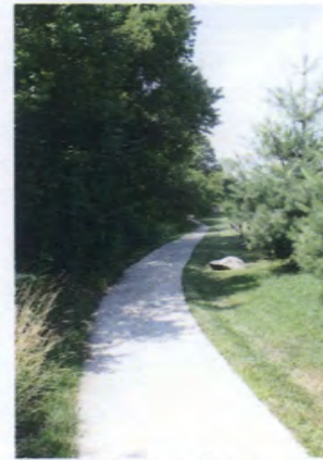
Proposed Concrete Trail Six foot wide walk Note: Trail on Lake Dam is not subject to washing or erosion and will remain gravel