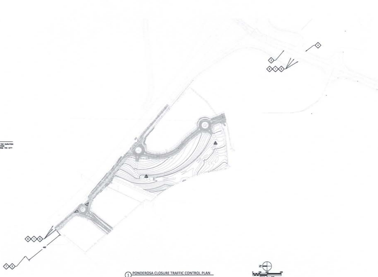
1 PONDEROSA CLOSURE TRAFFIC CONTROL PLAN