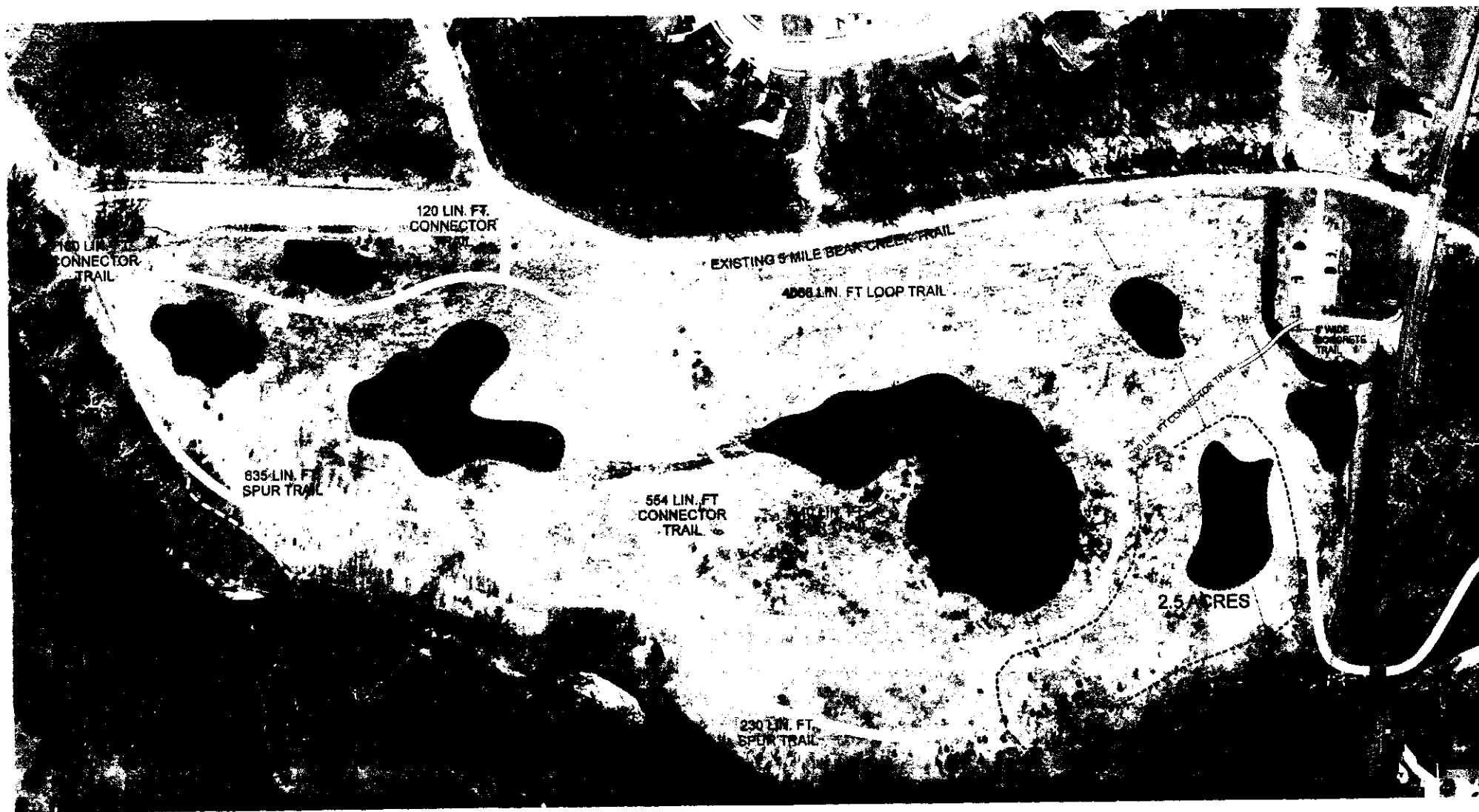
Proposed Garth Nature Trail 7-13-06 Conceptual Plan for Leash Free Area City of Columbia, MO Parks and Recreation