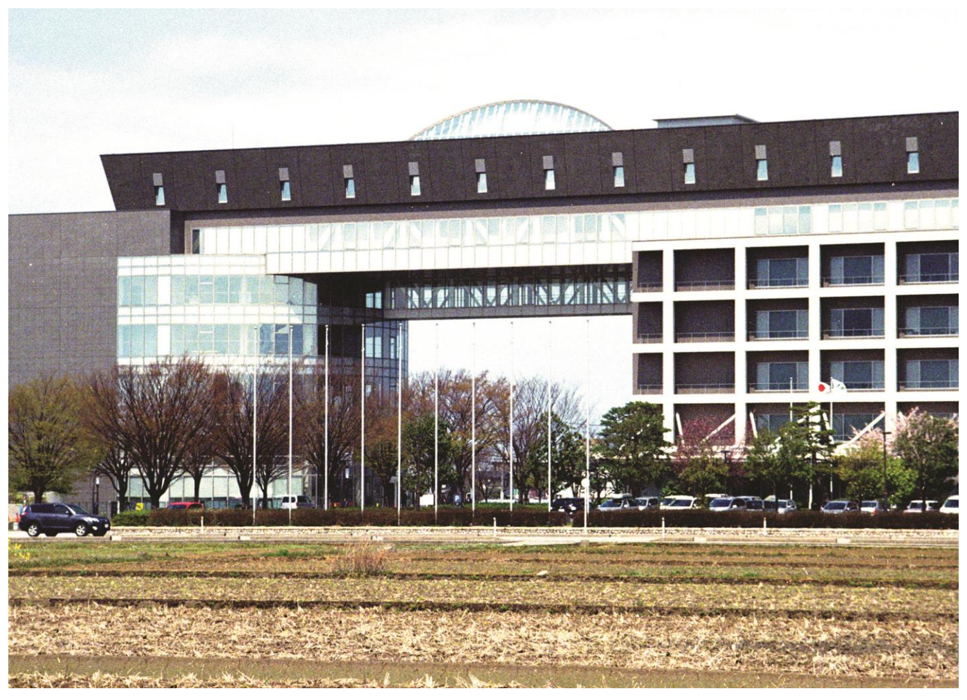
Hakusan City Hall