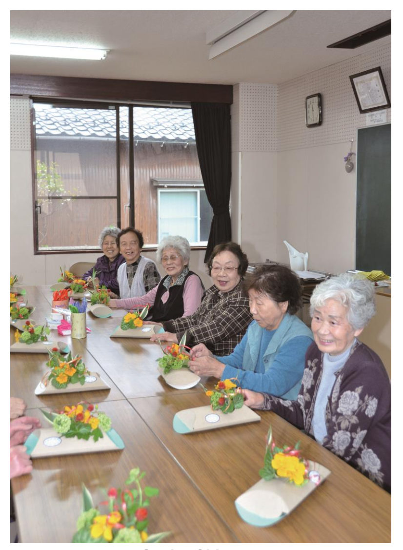
Senior Citizens