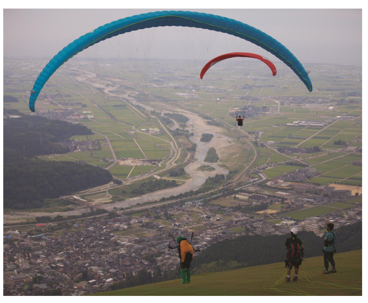
From Shishiku Heights By: Akira Kitada