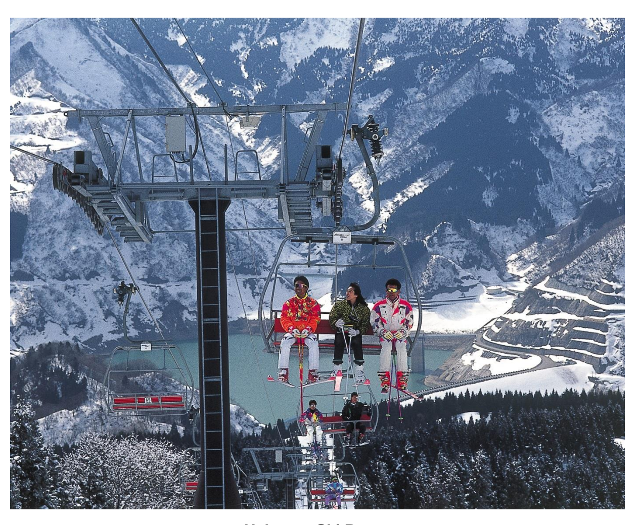
Hakusan Ski Resort