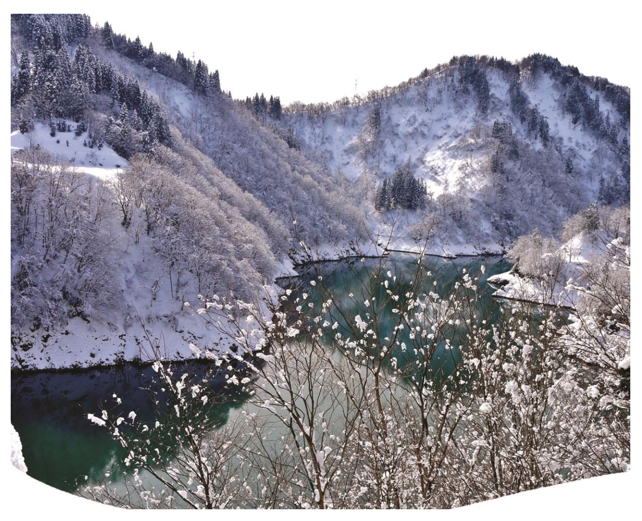
Dame Lake in Winter