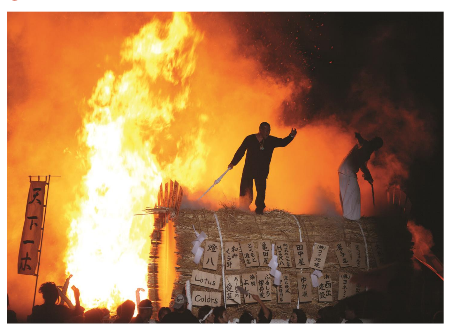
Matto Fire Festival By: Kenichi Takamoto