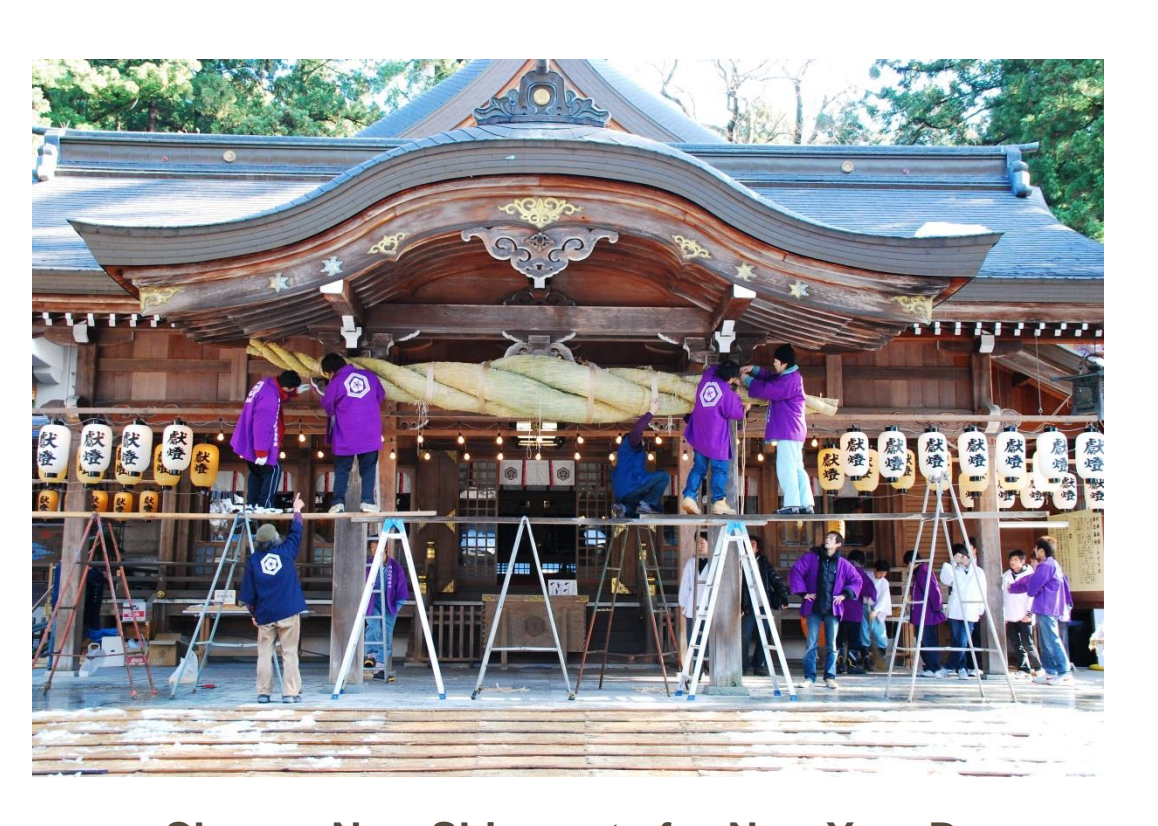
Change New Shimenata for New Year Day

Members of the Matto Photography Club from Hakusan, Japan shared photos of their city that explored the theme of a community as a place where we live, love, work, learn and play.