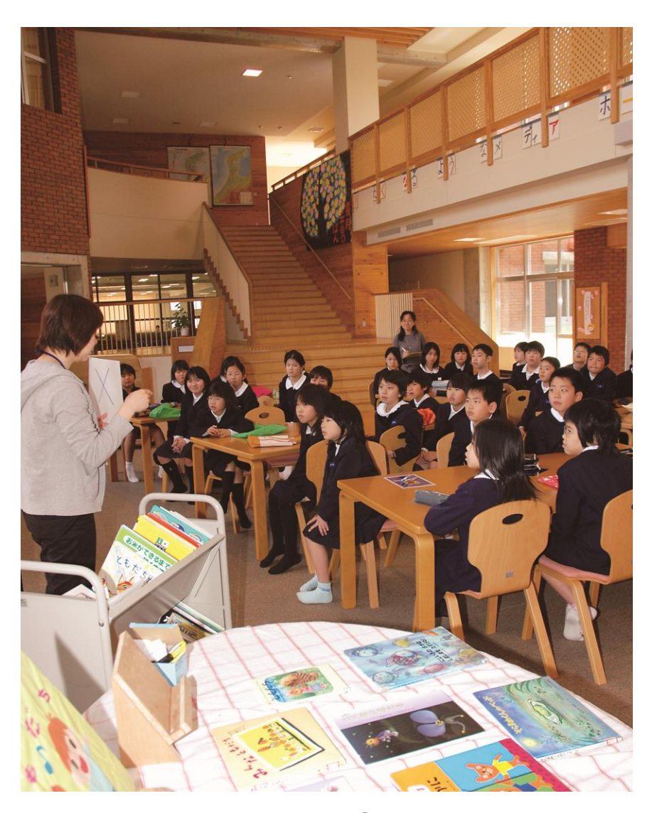
Elementary School