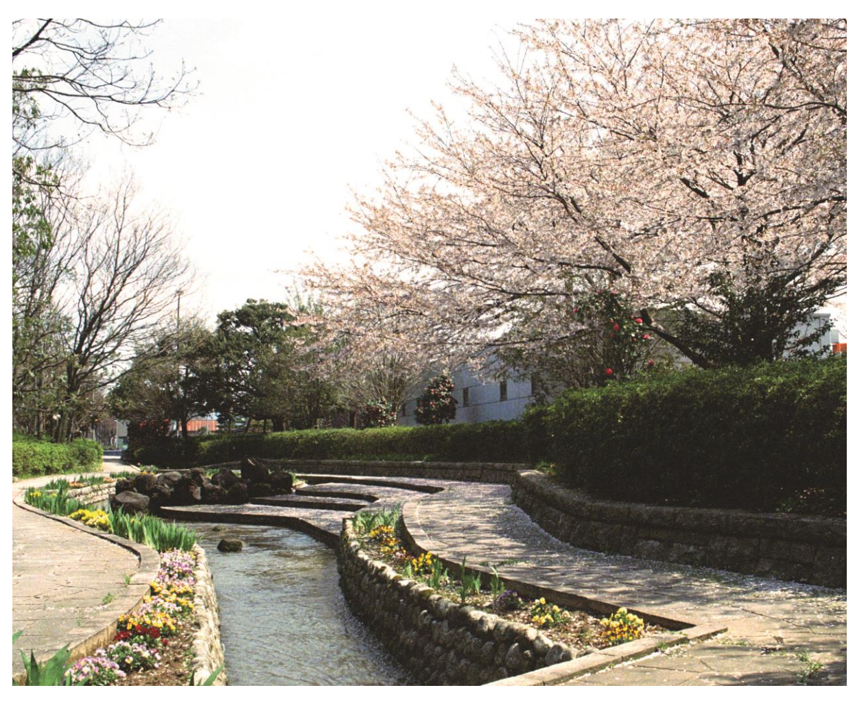
Garden in Matto General Athletic Park By: Naoki Kawagishi