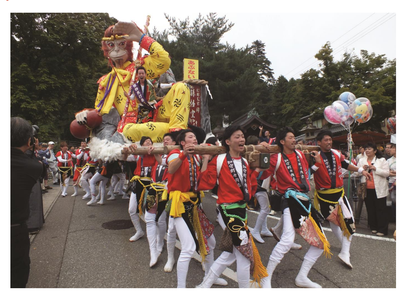
Hourai Festival By: Yoshikazu Matsubayashi