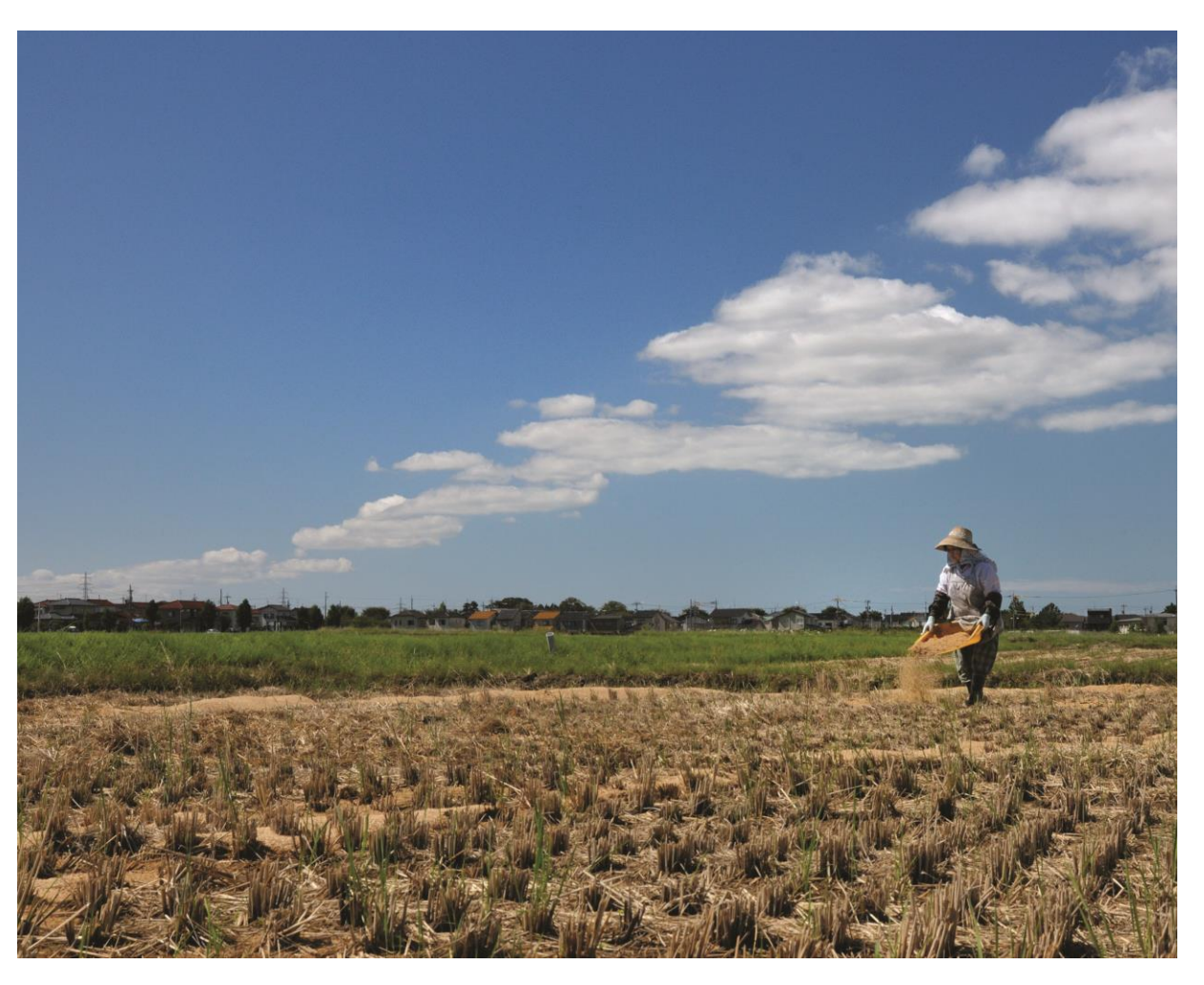
After Harvest By: Akio Nakagawa