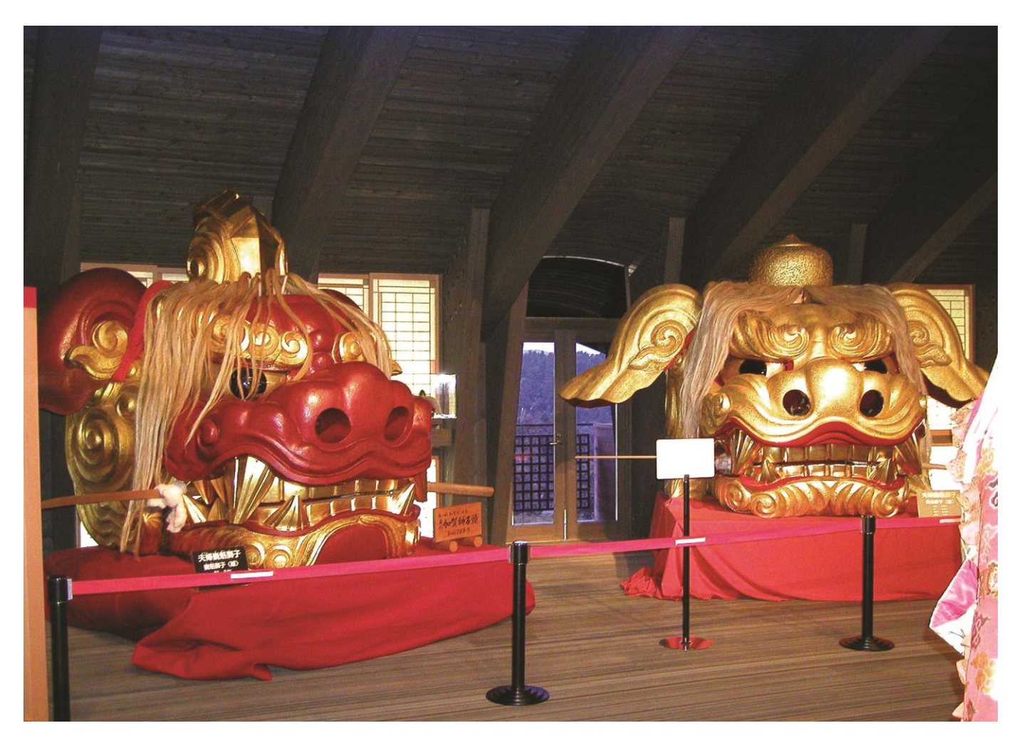
Shishigashira, Lion Head Shishi World Museum