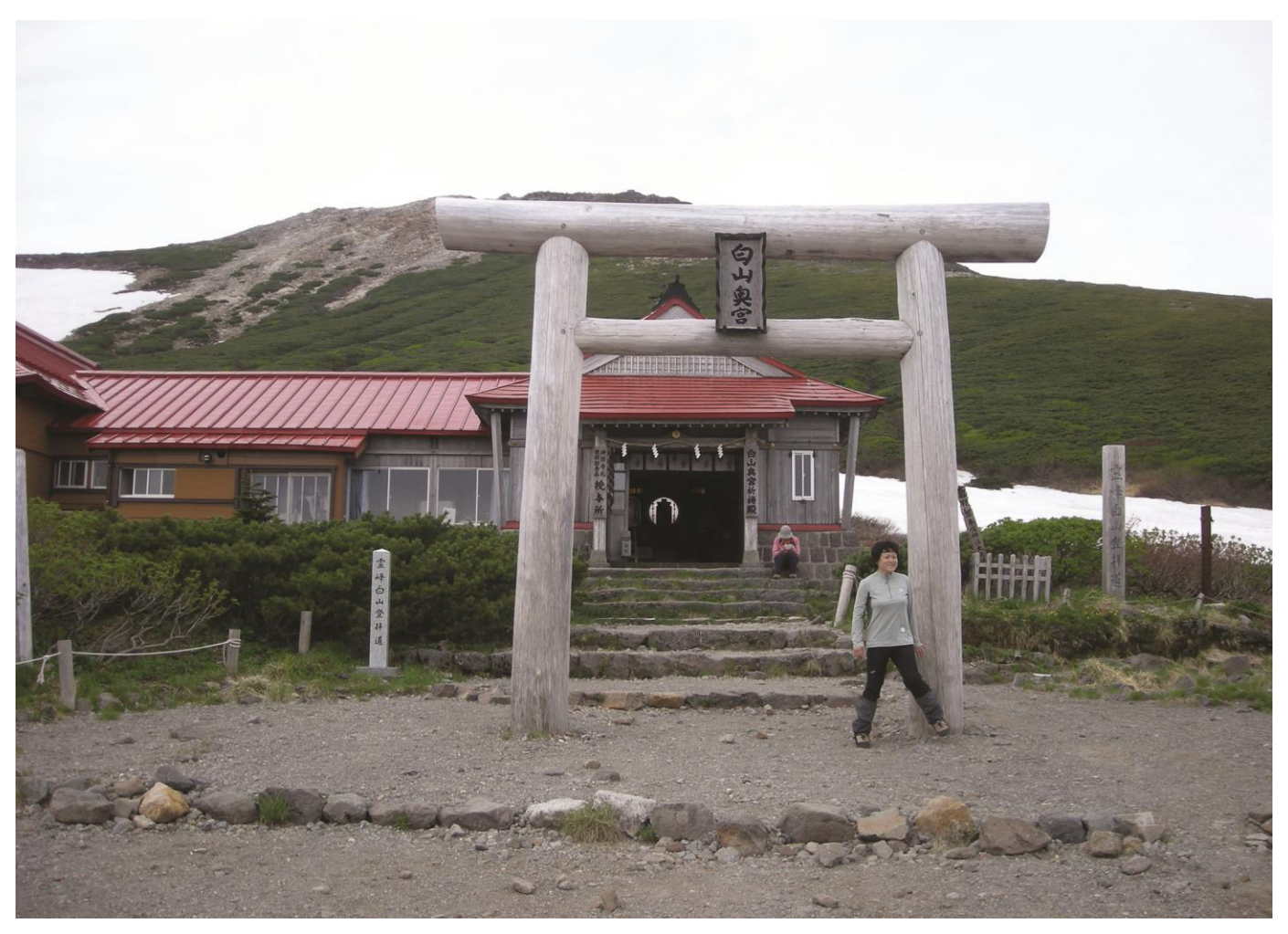
Hakusan Okugu Shrine (top of Mt. Hakusan)