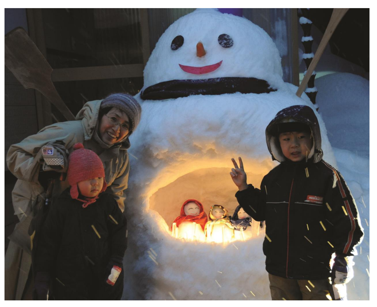
Snowman Festival in Shiramine District By: Ichizo Ikeda