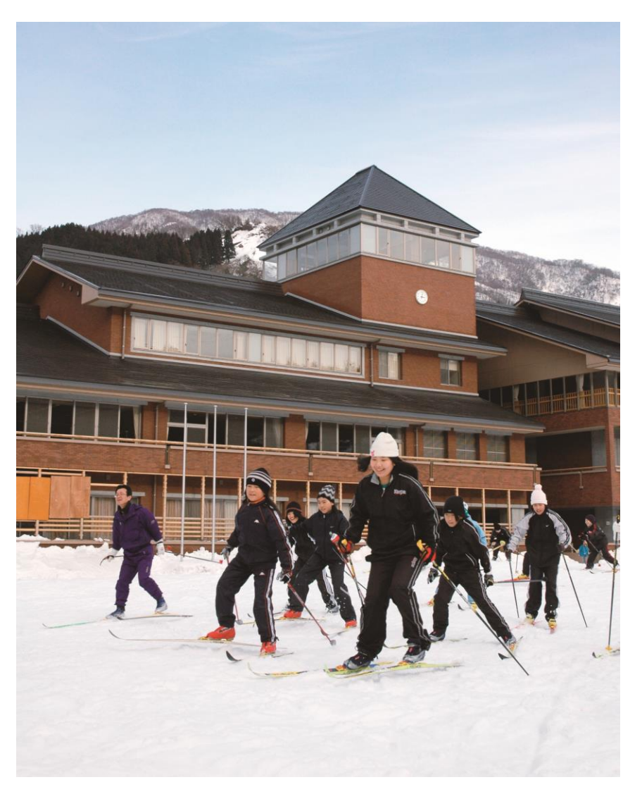
School at the Mountain Area