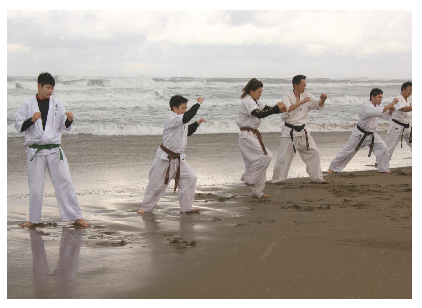
Karate - Winter Practice at Matto Beach