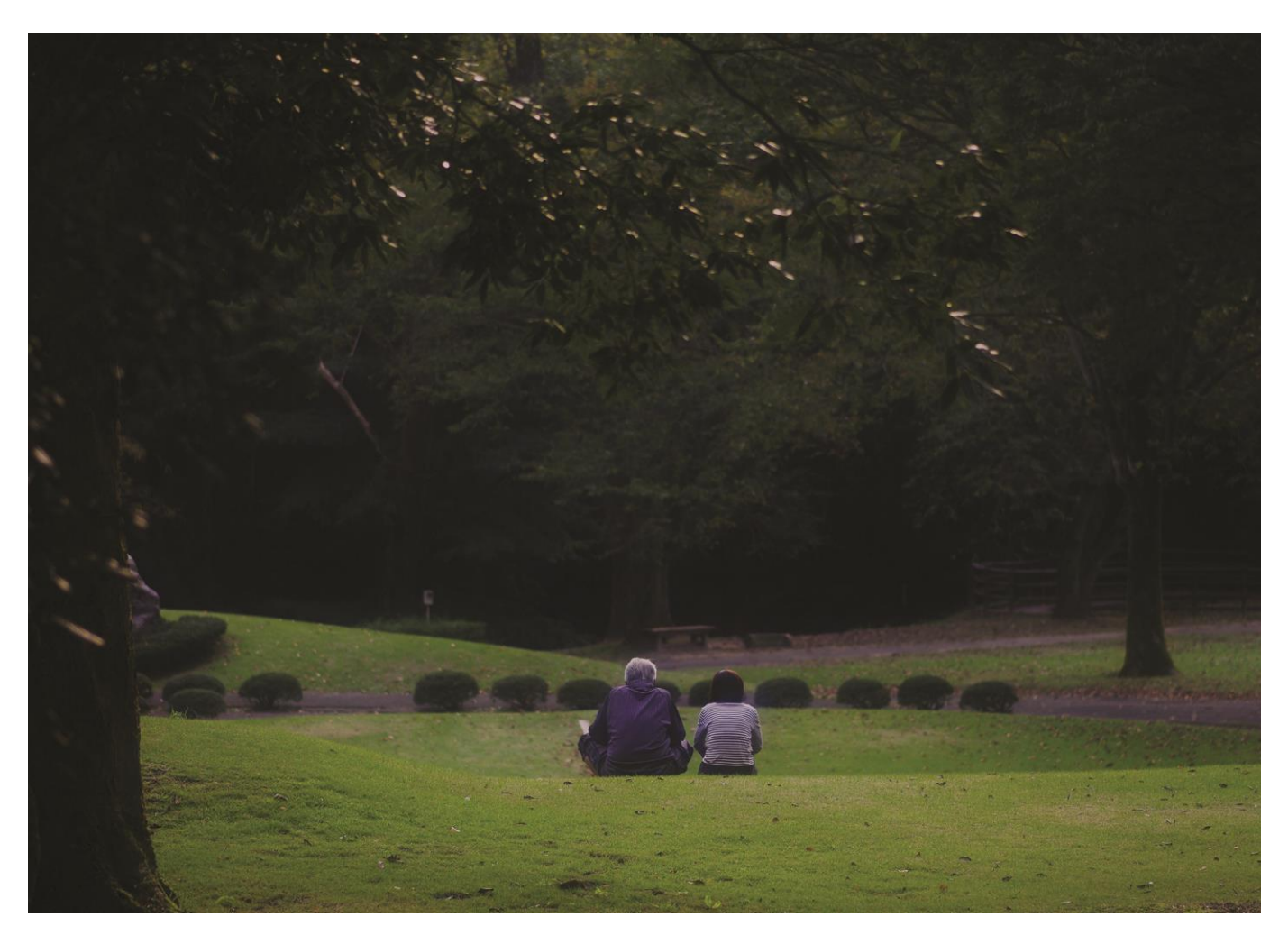
Hakusan Woodland Park