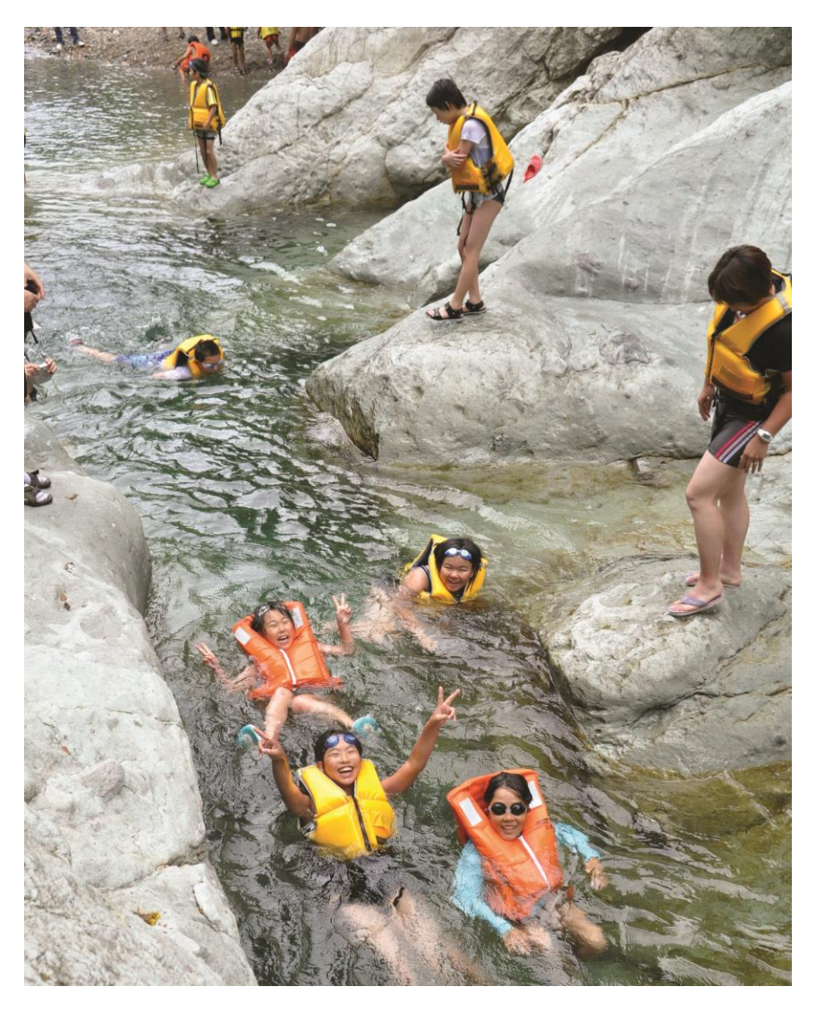
Water Park