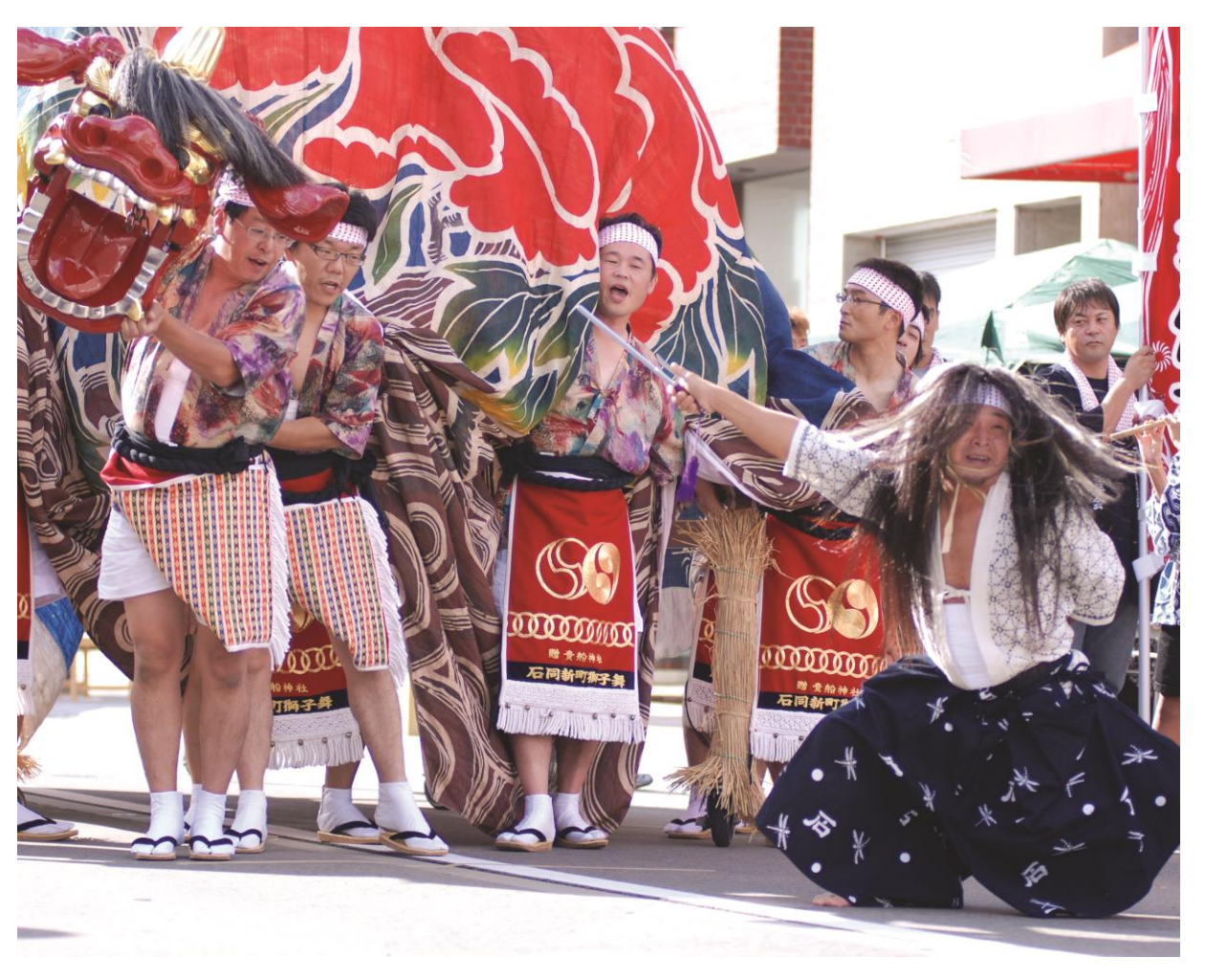
Shishi-mai, Lion Dance (Autumn Festival)