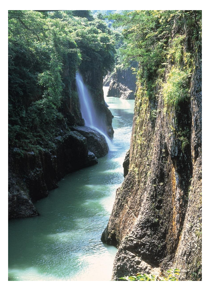
Tedori Gorge